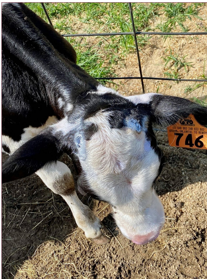
Figure 3. Apply pressure with the hot iron (top left photo) for 10 to 20 seconds. To ensure horn growth will not occur, check the color of the germinal tissue where the horn bud is. A copper-looking color signifies destroyed germinal tissue (top right photo). To limit infection, spray aluminum-based bandage on the horn bud site and spray around the area with fly spray (not directly on the horn bud).