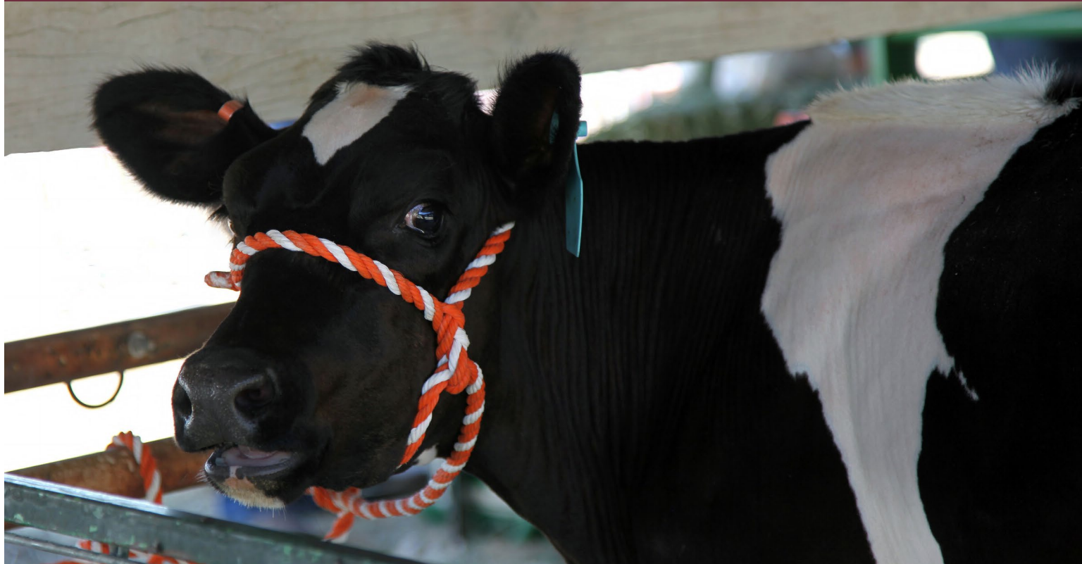
Figure 1. This is an example of a properly restrained calf for disbudding procedures.

The practice of dehorning or disbudding dairy calves has been implemented on modern dairy farms to prevent injury from horns to caretakers and other animals in the herd. Horn removal also helps prevent problems with horns catching in head locks or chute systems when cattle are being worked. Although often used interchangeably, the terms disbudding and dehorning have different meanings. Disbudding is the destruction of the horn-producing cells of the horn bud, typically in calves less than 8 weeks of age. The horn attaches to the frontal sinus of the skull at about 8 weeks of age. Dehorning takes place after this attachment at 8 weeks or older. Dehorning is more invasive and should be done by a veterinarian, while disbudding is a management practice that can be done by dairy producers.