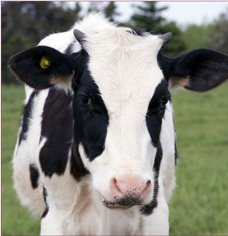
Figure 2. This weaned heifer calf has horns that are already fused to its frontal sinus.

Note that each producer could choose more than one method. Of these methods, only hot iron and caustic paste met the standard for average age of method application of 8 weeks (done on average at 7 weeks and 2 weeks of age, respectively). When done before 8 weeks of age, scooping can also be used as a method for disbudding. Tube, spoon, or gouge are done at 14 weeks on average, while saws, wires, or Barnes are done at 22 weeks on average. Saws, wires, or Barnes are done when the horn is fully developed, and these methods are not recommended.