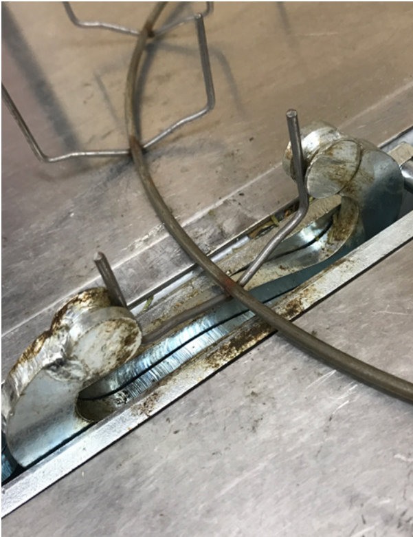
Figure 2. The clamp mechanism pinches heavy-gauge wreath wires around a gathered bunch of plant material stems.