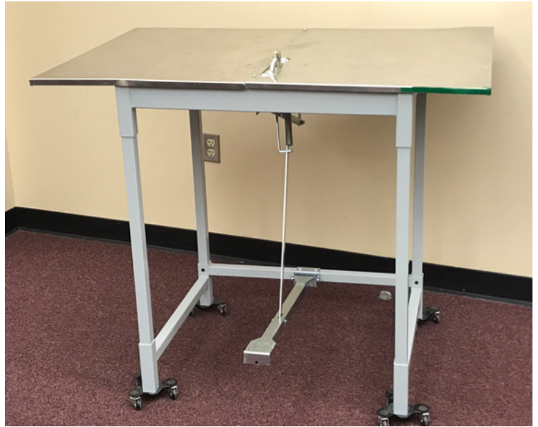
Figure 3. A pedal-operated clamp mechanism attached to a work table is the best practice for commercial producers.