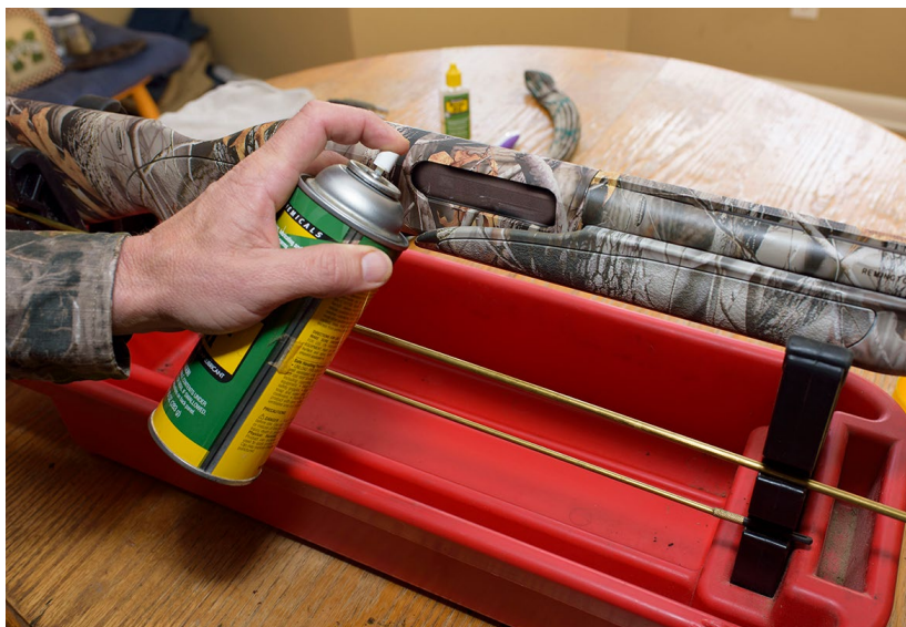
Figure 1. Be sure the gun is empty of ammunition before you start cleaning (top). A can of aerosol and a cleaning kit is ideal (bottom).