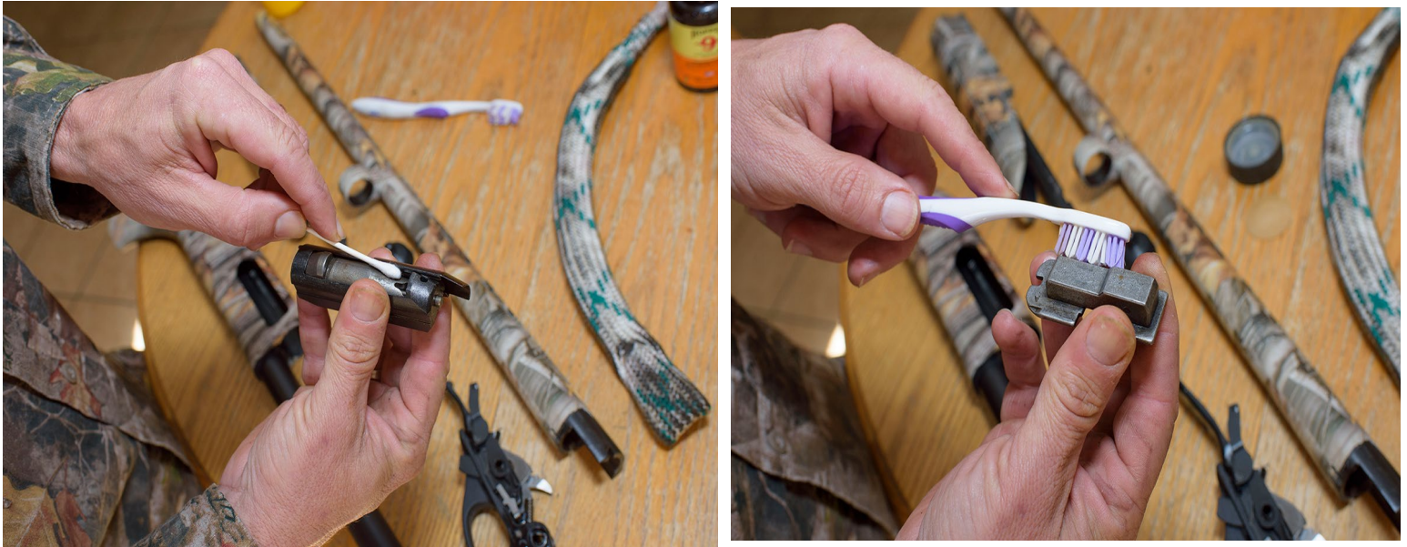
Figure 2. Always make sure to use the correct size brushes and swabs for your gun.

There are many different types of cleaners, and your local store can probably provide you with the supplies you need. All you will need is a can of aerosol or liquid gun oil and a cleaning kit with brushes, swabs, and cleaning rods. A word of caution: There are “universal” cleaning kits that come with several different types of brushes and swabs. Be careful with these. Make sure that you are using the correct size brushes and swabs for your gun so they don’t become lodged in the barrel or other parts of your gun.