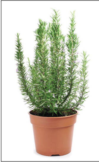
Rosemary is an evergreen shrub.

After the holiday season, you may move your rosemary plant outside and either keep it in the pot or plant it in your garden. Rosemary is a perennial in Mississippi and prefers full sun, but it will tolerate some shade. If you wish to keep the topiary's shape, you will need to prune it often. Don't discard the pruned pieces. Use them in the kitchen to liven up your cooking.