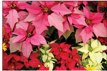
Poinsettias convey the holiday spirit.

Note: Although research has shown the poinsettia to be nontoxic, it is not recommended for consumption by humans or animals. Some individuals may develop skin irritation when exposed to the milky sap.