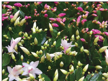
Schlumbergera flowers are beginning to open.

For repeat flowering, place cacti in a room with cool temperatures (60 to 65 degrees), stop fertilizing, allow the soil to become dry between waterings, and provide 12 hours of uninterrupted darkness every night for 5 to 6 weeks. Once flower buds appear, move the plants to a bright-light location and resume normal watering and fertilizing. Maintain cool temperatures (60 to 70 degrees) to avoid bud drop. Cacti are easy to propagate by making cuttings of stem sections. Propagation works best when done in early spring or summer.