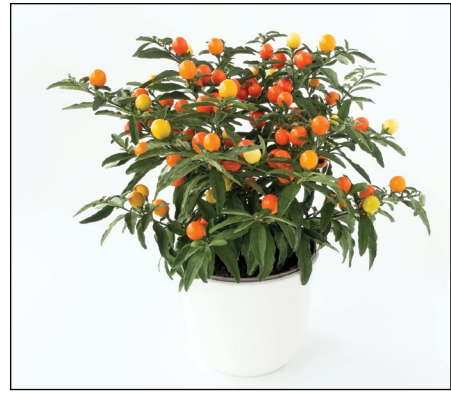
Jerusalem cherry fruits change color from yellow to orange as they mature.

Another common holiday plant is the Jerusalem cherry, also known as the Christmas cherry or winter cherry. This bushy evergreen shrub produces white flowers in the summer that give rise to small, round, reddish-orange fruit in the winter, usually around Christmas.