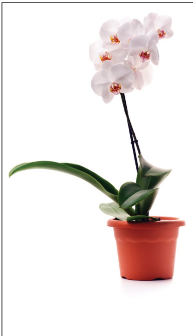
Phalaenopsis orchids are showy and long-lasting.

It is possible to encourage the plant to send out more blooms after the first ones have faded. Prune the spike to the second or third node to encourage a lateral bloom spike to grow.