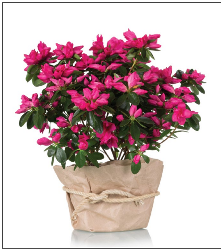
This azalea is in tight bud.

passed. The azalea could be planted during the growing season into a landscape bed in a shady location. During the growing season, use a fertilizer recommended for acid-loving plants, following the directions on the label.