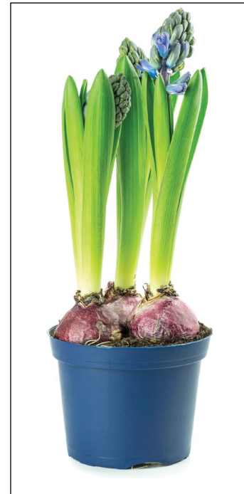
This hyacinth is just beginning to show color.

A decidedly fragrant flower, the hyacinth is appreciated by anyone who loves a breath of spring. Hyacinths are bulb plants, and their care is similar to that of tulips. You will enjoy a longer display of color if the plant is kept cool. Hyacinths are large, heavy-headed flowers bearing dozens of florets per bloom spike. Sometimes the weight of the flower head is so heavy, they need staking to keep upright. The color range of hyacinths includes white, pink, pale yellow, blue, and violet.