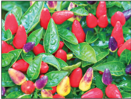
Ornamental pepper fruits display bright colors.

Ornamental pepper plants are often found in stores during the fall season. These plants should be kept inside when temperatures are expected to drop below 40 degrees. They produce colorful fruits that come in a wide range of shapes, sizes, and colors, including brown, violet, and nearly black. A single plant can have three different colors of peppers on it. These plants make great houseplants as well as ornamental landscape plants.