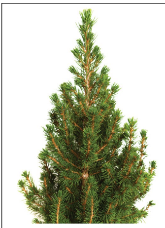
This Dwarf Alberta Spruce is a mini Christmas tree.

Once you have selected your spruce tree, give it a thorough watering before display. Keep the soil evenly moist but not wet or standing in water.