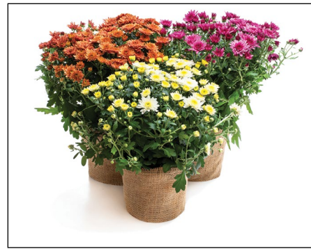
These chrysanthemum plants have bronze, lavender, and white blooms.

If you are looking for long-lasting color, potted chrysanthemums are a great choice. In the 20th century, they were the mainstay of all potted flowering plants but have been superseded by orchids. Now, varieties new, as well as tried and true, can be spotted in supermarket floral departments, florists, and other retail plant outlets. Chrysanthemums, also known as mums, are triggered into flowering by the shortening of day length. Therefore, the natural time to find them in bloom in the garden is in the fall, when nights are getting longer, until frost kills the above-ground portion of the plant.