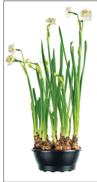
A double variety of paperwhite narcissus.

watertight container with washed pebbles and then place the bulbs, pointed side up, on the surface. Add additional gravel so that about ½ to 1 inch of the bulb is exposed. Add water to the container so that it touches the bulbs' bases, but do not add so much that the bulbs are submerged. This will cause them to rot. If growing paperwhites in soil, follow the same planting depth and keep the soil moist but not wet.