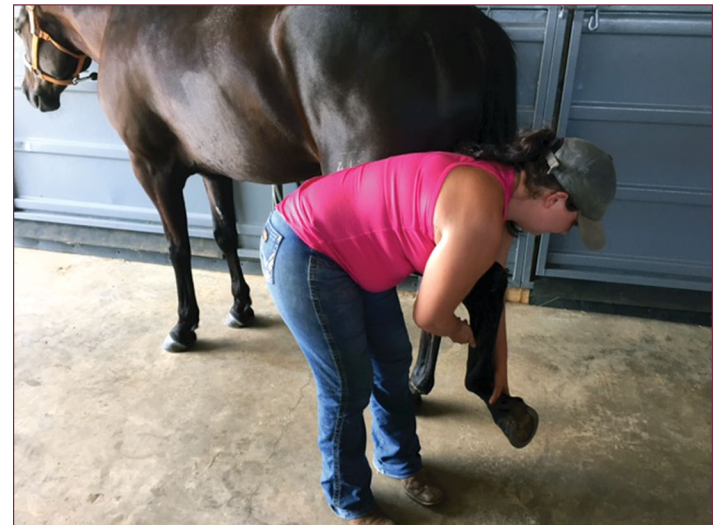
Figure 3. Picking up a horse's hoof safely by staying close and alert to avoid being kicked.

most head injuries. Helmets not only protect your head from a fall but also help absorb energy to reduce injury to the skull or brain.