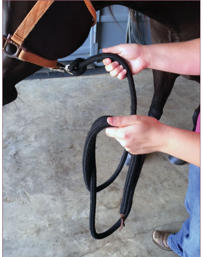
Figure 1. Correct way to lead a horse with the lead rope held close to the halter, keeping a safe distance from the animal.

Many horses tend to run and play when they are turned out, especially if they have been stalled for a time. Always lead a horse into an area and turn it around so that it is facing toward the in-gate and you are between the two. In this way, if the horse decides to run and/or kick, it will have to turn around 180 degrees to do so, thus giving you time to move away. Horses that are led into a pen