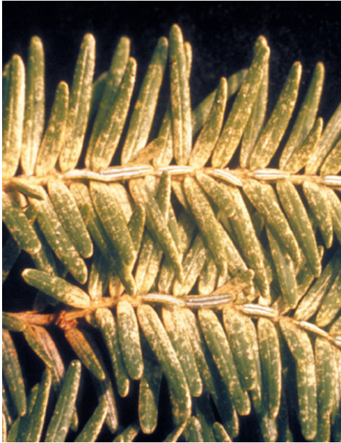
Figure 7. Spider mites.