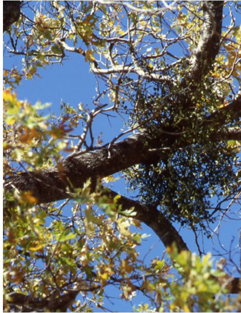
Figure 8. Mistletoe.