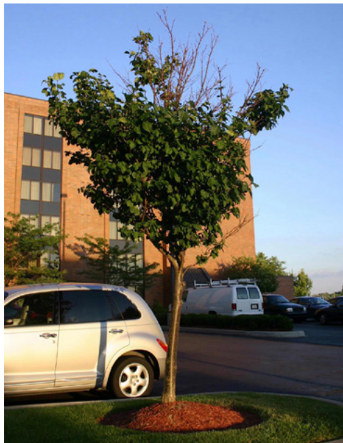
Figure 2. Long-term drought stress and crown dieback on a Japanese tree lilac ( Syringa reticulata ).