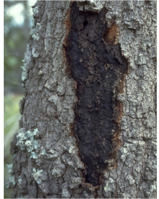
Figure 9. Hypoxylon canker.