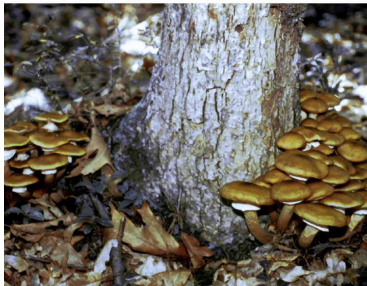
Figure 6. Armillaria root rot.