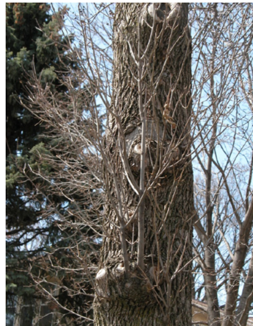
Figure 4. Epicormic branching.