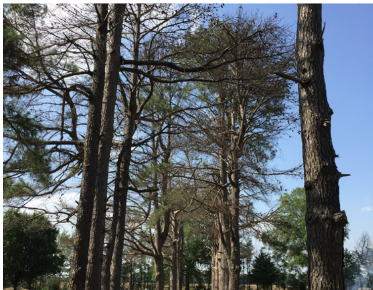
Figure 5. Ips beetle damage.