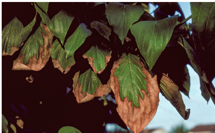
Figure 1. Leaf scorch on dogwood ( Cornus spp.)

Unlike forest-grown trees, trees in urban and landscape settings must adapt to an increased number of environmental stressors. These include compacted soils, contaminants, diseases, higher temperatures, mechanical damage, restricted root systems, and more. In cases where water stress occurs over a short period of time (such as a single growing season), homeowners will observe wilted leaves, leaf scorch, or leaves prematurely dropping from the tree. The effects of long-term (more than a growing season) drought on plant health are less obvious but more serious. Mississippi has experienced frequent periods of drought in the past several years. Consequently, it is important for homeowners to learn how to identify symptoms of drought stress and how to keep trees healthy.