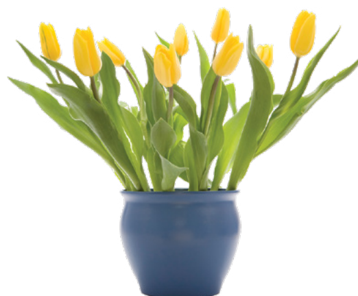
Figure 5. Varieties of tulips can be forced into bloom.

Other hardy bulbs that can be forced include dwarf iris ( Iris reticulata ), Dutch iris ( Iris × hollandica ), grape hyacinth ( Muscari spp.), glory of the snow ( Chionodoxa luciliae ), snowdrop ( Galanthus nivalis ), star of Bethlehem ( Ornithogalum spp.), and summer snowflake ( Leucojum aestivum ). Using the term “bulb” loosely, other varieties that could be forced are winter aconite ( Eranthis hyemalis ) and the windflowers Anemone coronaria and Anemone blanda .