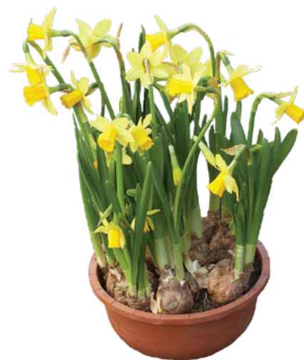
Figure 3. Daffodils are one of the easier bulbs to force into bloom.