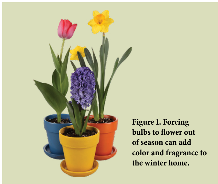
Table 1. Recommended bulb varieties for forcing. (Check the labels of other varieties for more suitable options.)

The most common bulbs for forcing are crocuses ( Crocus spp.), Figure 2; daffodils ( Narcissus spp.), Figure 3; hyacinths ( Hyacinthus spp.), Figure 4; and tulips ( Tulipa spp.), Figure 5. Crocuses are actually not bulbs but corms, but for this publication, “bulb” will be used to include corms and tubers. See Table 1 for varietal recommendations of these bulbs for forcing.