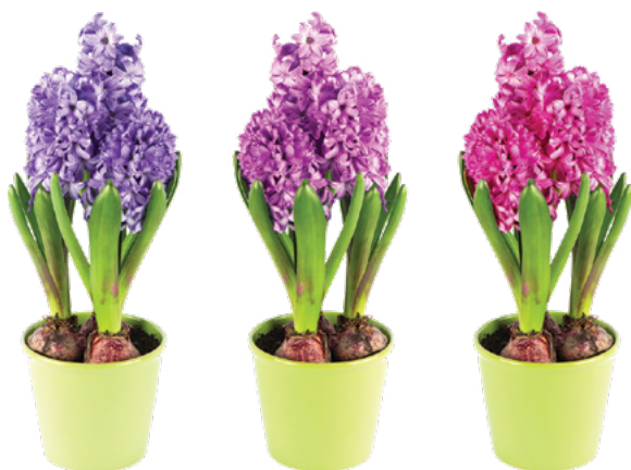
Figure 4. Hyacinths add color as well as fragrance to the home during the winter months.