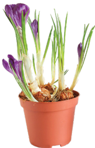
Figure 2. Crocus, a cold-hardy bulb, can be forced to bloom early.