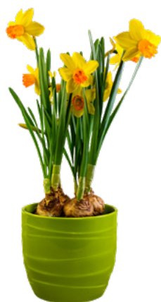
Figure 6. Larger bulbs like daffodils can be potted with the upper portion of the bulbs exposed.

*Miniature daffodils require fewer cooling weeks than the larger types; 10 to 12 weeks is usually enough.