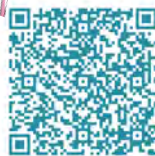
EXHIBIT DAYS THANK YOU!

This is a BIG "THANK YOU" to all exhibitors, the Lee County Board of Supervisors, the Tupelo Children's Mansion, and all who helped make our 2025 Exhibit Days possible! It was wonderful to see what imagination & creativity we have in our local area. We hope you continue to cultivate your passions, and we look forward to next year!