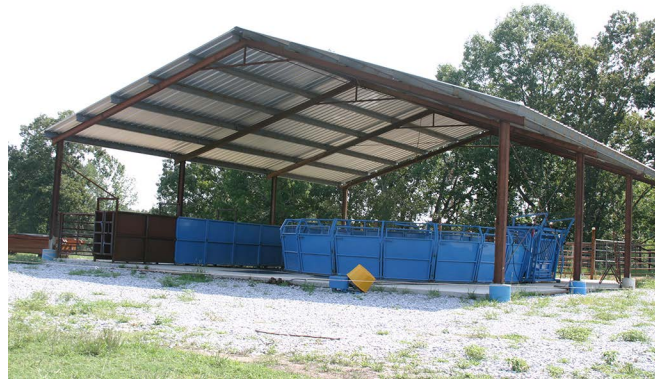
Figure 18. Covered cattle handling facilities.

Begin the construction sequence by doing any dirt work needed to raise or level the construction site. Proceed with setting the sturdy hinge post for the crowding pen gate. Then hang the crowding pen gate. Next, set the posts for the crowding pen wall using the gate as a guide. Allow adequate space for the pen panels between the gate edge and the inside edge of the posts. Finish setting all posts in the crowding pen area including the opening into