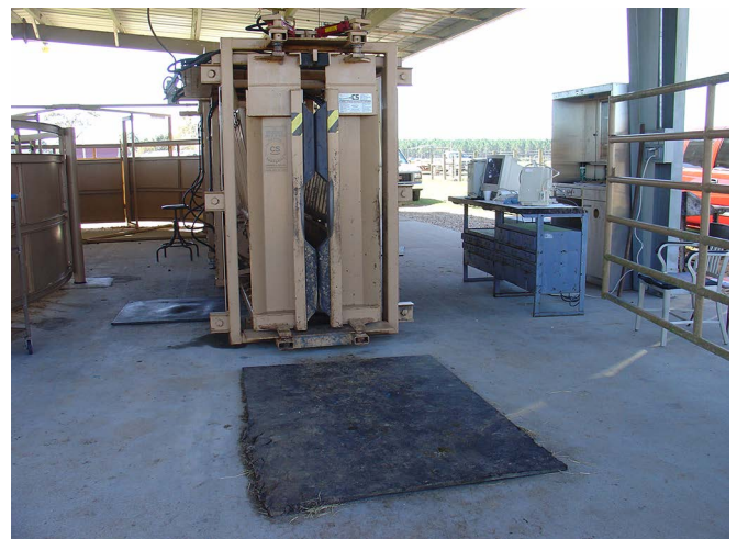
Figure 11. Nonslip mat at chute exit.