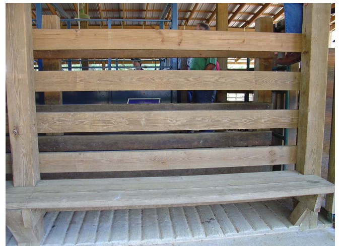
Figure 4. Catwalks along outside of alleys.