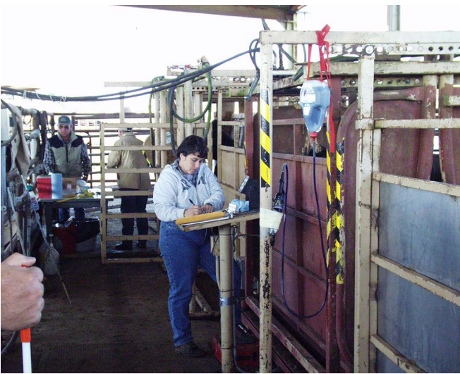
Figure 17. Separate scales compartment before squeeze chute entrance.