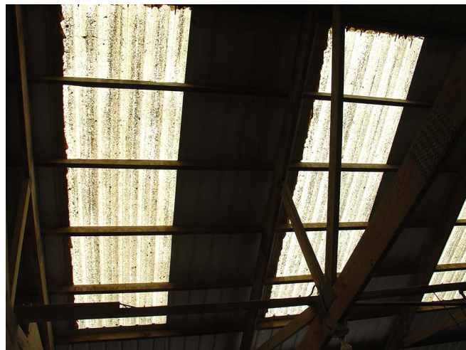
Figure 19. Translucent roof panels (skylights).