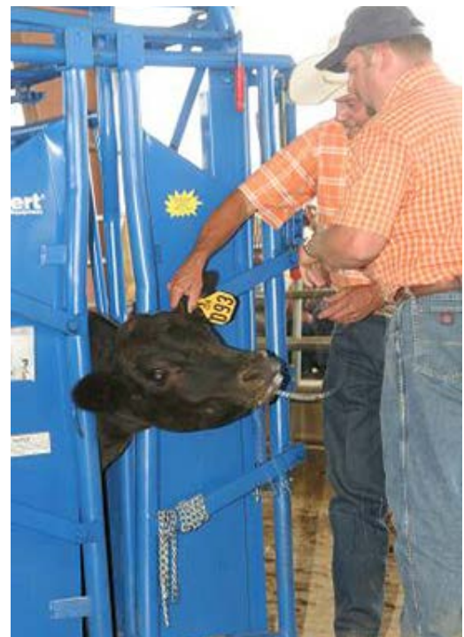
Figure 7. Squeeze chute with head catch.