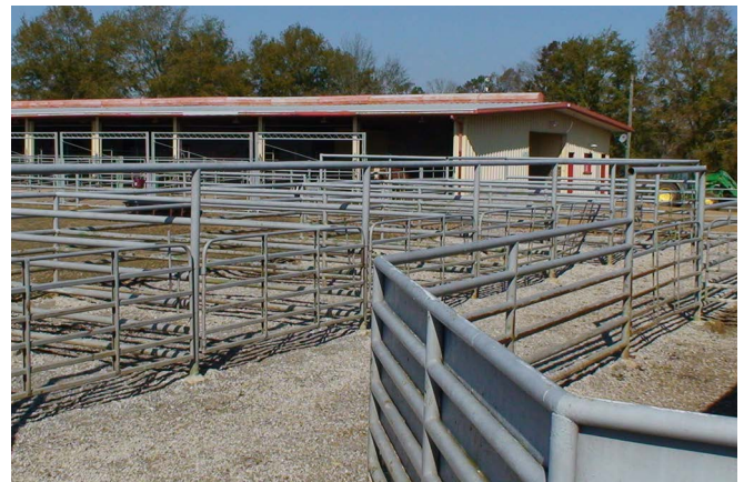
Figure 9. Sorting pens.