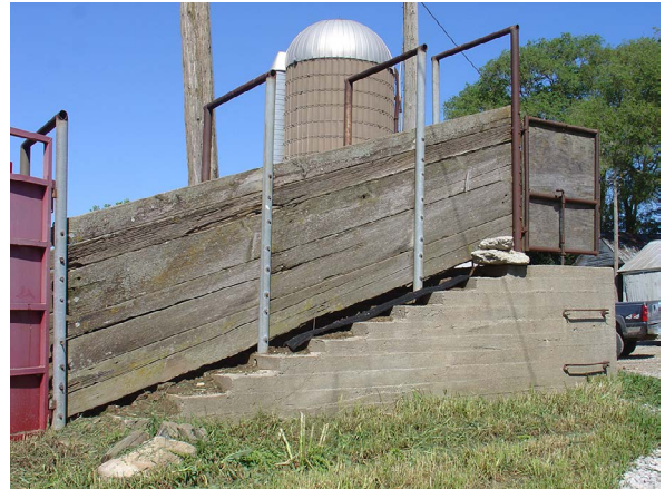
Figure 13. Permanently fixed loading ramps.