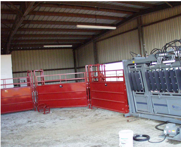
Figure 2. Curved, solid-sided alley.

Alley backstops are used to, as the name implies, keep cattle from backing up as they move down the alley. These devices usually are made of pipe and hinged to the top alley brace so that they move up as the cattle go under them but then fall back down below hip level after cattle move past. They are typically adjustable to facilitate handling cattle of various heights. If backstops are used, place them in strategic locations within the alley to make handling more efficient. Improperly used, backstops may contribute to unnecessary bruising of the backs and rumps of cattle.