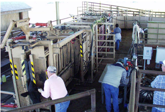
Figure 6. Slider (alley divider) extended outward between palpation cage and scale compartment.