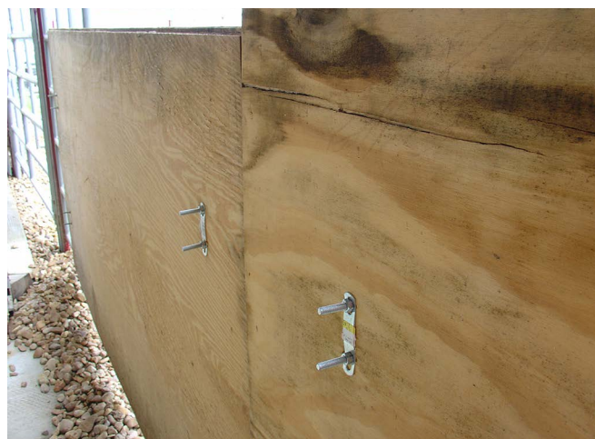
Figure 20. Protruding screws inside cattle handling paths could cause injury.