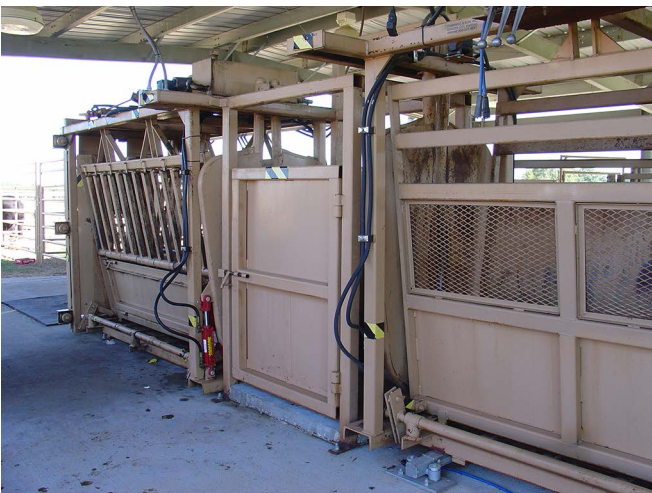
Figure 8. Palpation cages.