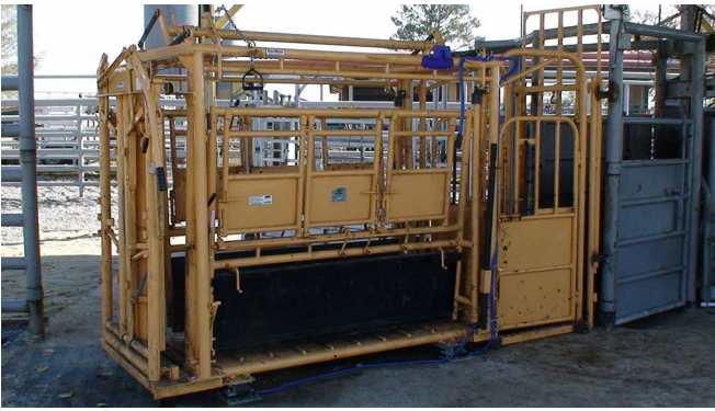
Figure 16. Scales mounted under squeeze chute.

Capturing cattle weight is important for herd performance programs, genetic improvement efforts, nutritional management, and animal health product dosing. Integrating scales into the alley improves efficiency by letting a handler record cattle weights while other handlers are performing management practices in the squeeze chute. This can be accomplished by using permanent scales behind the chute, load bars under the chute, or portable weigh pans placed in the alley floor.