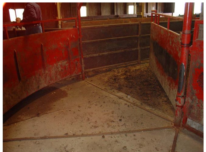
Figure 1. Crowding pen.

Crowding pens typically have a gate that swings around behind the cattle to guide them single-file into the working alley. Gate stops at set intervals allow the sweep gate to be held securely in place against cattle pushing back against it. The handler is able to push from behind the gate and use the self-latching gate stops to protect against the gate being