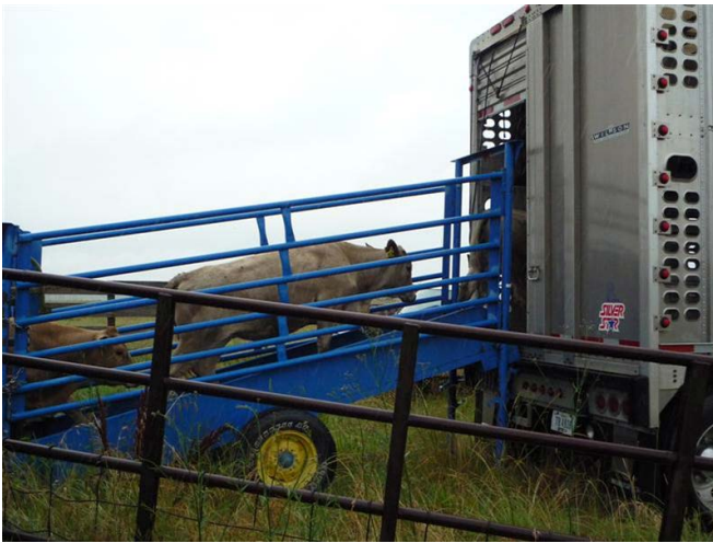
Figure 12. Portable loading ramp.