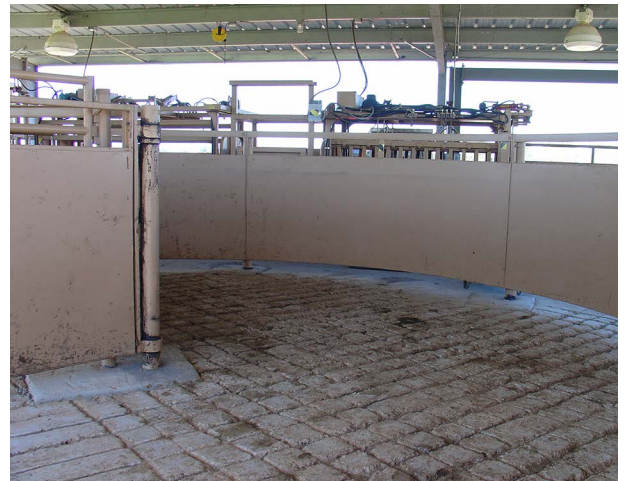
Figure 10. Textured concrete flooring in crowding pen area.

It is also useful to place non-slip mats in key areas, such as in front of the chute exit, to improve cattle traction. Mats should be heavy enough not to slide or fold readily as cattle trample over them. Textured, heavy-duty rubber mats are easy to clean and provide a durable, non-slip surface that can be moved to various flooring areas as needed.