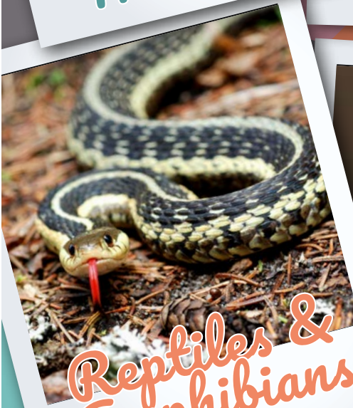
Reptiles & Amphibians