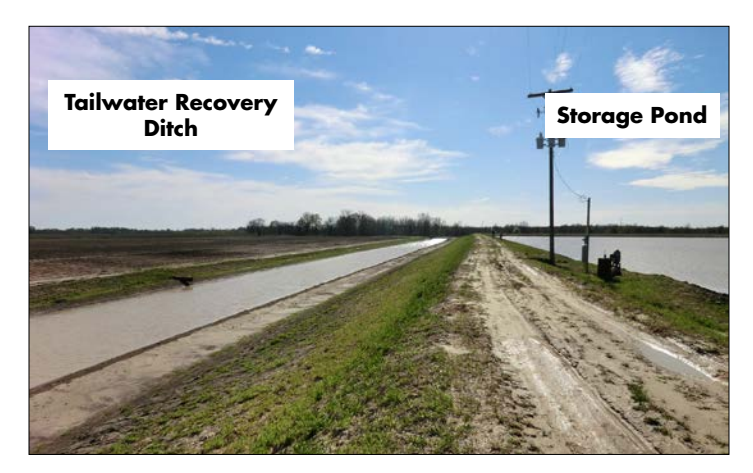
Figure 1. An on-farm water storage system typically consists of a pond and a tailwater recovery canal.

An on-farm water storage (OFWS) system is a structural best management practice that captures and stores surface water runoff so that it can be used at a later time for irrigation. These systems can capture runoff both from rainfall and tailwater from furrow irrigation, and they can be constructed with only a storage pond, with an enlarged tailwater recovery (TWR) ditch, or with a TWR ditch and a storage pond (Figure 1). The pond is typically constructed on an area of the farm that is less productive, such as a low-lying area that does not drain well. The TWR ditch and pond are positioned where they can capture adequate runoff yet remain accessible to fields that will be irrigated using the stored water. The designs of the systems vary depending on where in Mississippi they are installed. It is important to note that Section 404 of the Clean Water Act (CWA) requires a permit for the discharge of dredged or fill material into waters of the United States, which includes wetlands.