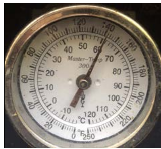
Figure 2. Temperatures above 130°F will kill pathogenic bacteria, fly larvae, and viruses.