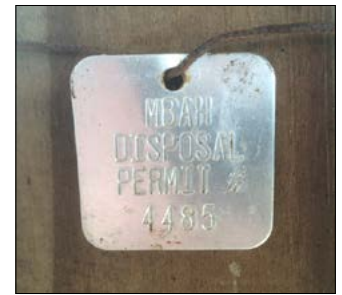
Figure 3. Mississippi poultry mortality disposal permit.

a layer of bird carcasses. Arrange the carcasses in a single layer side by side and touching each other. Place carcasses no closer than 6 inches from the walls of the composter. Carcasses placed too near the walls will not compost as rapidly because of lower temperatures and may cause odorous liquids to seep from the compost pile.