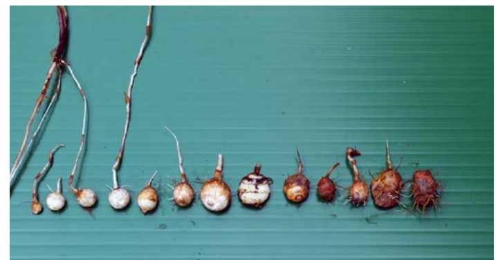
Figure 3. Yellow nutsedge tubers of varying maturity.