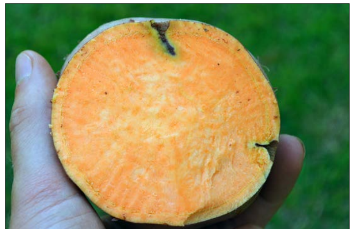
Figure 7. Yellow nutsedge shoots, rhizomes, and tubers in sweetpotato storage roots.