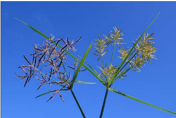
Figure 5. Inflorescences of purple (left) and yellow nutsedge (right).