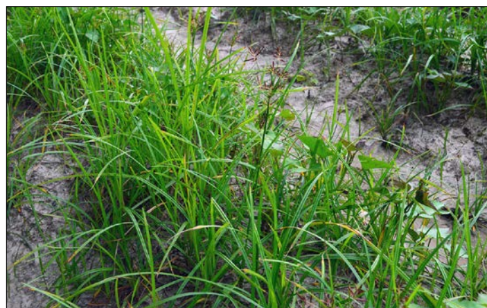
Figure 1. Yellow nutsedge in sweetpotato plant propagation beds (top). Yellow and purple nutsedge in a sweetpotato production field (bottom).