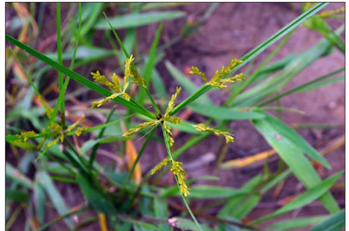
Figure 6. Rice flatsedge in a sweetpotato production field (top); close-up of inflorescence (bottom).