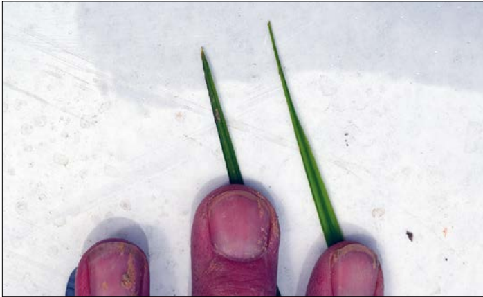
Figure 4. Leaves of purple nutsedge (left) are deep green and come to an abrupt point. Leaves of yellow nutsedge (right) are yellow-green and more tapered.

are often consumed by wildlife including wild turkeys and wild hogs. Purple nutsedge tubers are bitter and often form along the entire length of the rhizome. Yellow nutsedge leaves are yellow-green and have a long, tapered point (Figure 4). Purple nutsedge leaves are deep green and come to an abrupt point. Inflorescences (i.e., groups of flowers) are straw-colored on yellow nutsedge and reddish-purple on purple nutsedge (Figure 5).