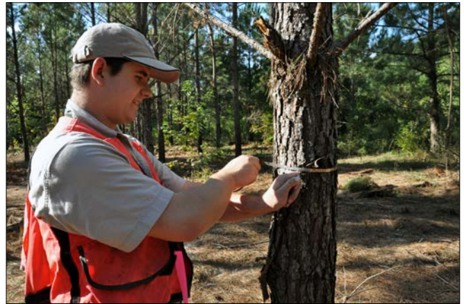
Figure 1. DBH measurement.

Tree diameter must be used to determine proper tree spacing. Tree diameter is measured at 4½ feet above the ground. Measurements at this height are called diameter at breast height, or DBH. DBH can be measured with a steel diameter tape or a Biltmore stick. The Biltmore stick is quick and easy to use but is not as accurate or consistent as a diameter tape. For information on how to construct or obtain a Biltmore stick and on proper DBH measurement techniques, consult your Extension forestry specialist, or read MSU Extension Publication 1473 4-H Project No. 7: Measuring Standing Sawtimber .