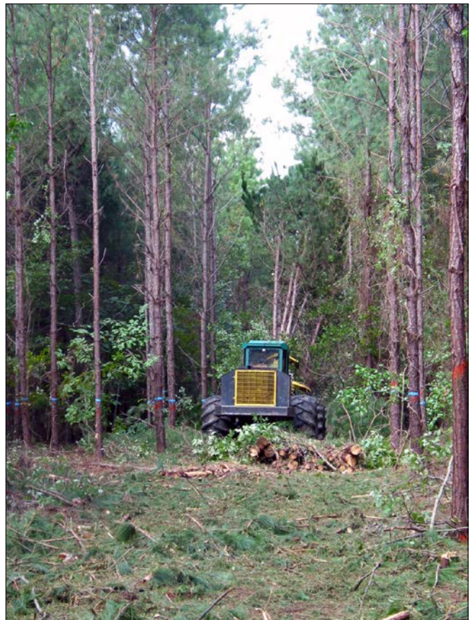
Figure 5. Unmarked trees being removed.

Leave-tree marking is not difficult, but, upon completion, you should check your work for large-scale mistakes. Take time to walk back through the stand and observe the spacing of leave trees. The paint marks let you see what the stand will look like after it has been thinned. Now is the time to catch any major errors. Once the stand is thinned, any unchecked mistakes will probably be irreversible. The next time you thin, you may need to use a different color paint to differentiate leave trees from those to be cut if sufficient time has not passed for the original paint to degrade.