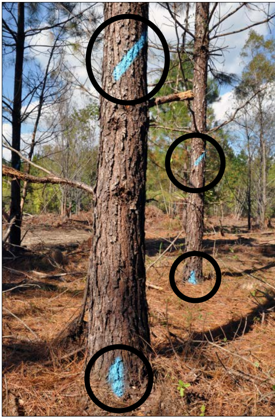
Figure 4. Marked trees.