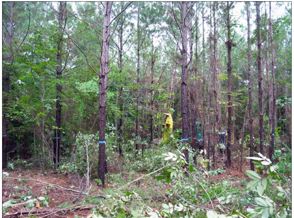
Figure 6. Completed thin.