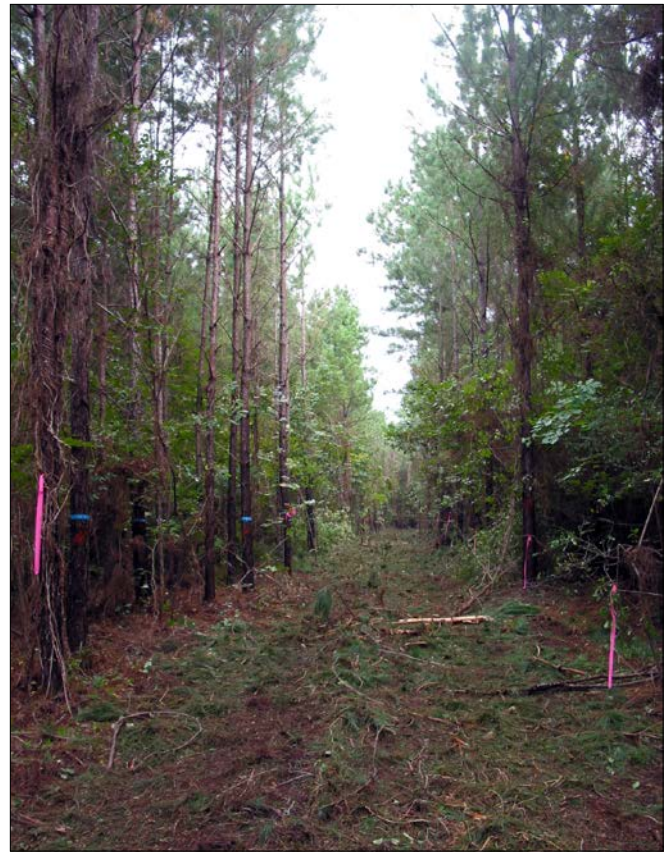
Figure 2. Compass lines marking access corridor.

If no “good” tree is present, a less desirable tree (forked, crooked, small, etc.) may be used in the square rather than leaving the area empty. Again, choose the best tree available in each given square. After selecting the tree you plan to leave, mark it with paint using a large slash at eye level and at ground level on the stump. Consider logging direction, and make eye level marks facing the expected cutting direction. Make sure to use paint generously so that loggers can see this is a marked