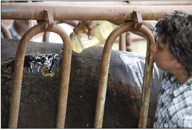
Figure 2. Preparing the area on an animal where the rump fat, ribeye area, and percent intramuscular fat ultrasound measurements will be collected.