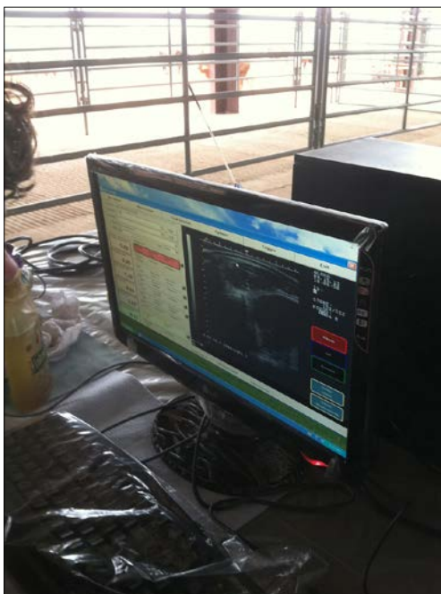
Figure 1. This monitor shows a cross-sectional ultrasound image.

The measurements collected through live animal carcass ultrasound can be used to estimate carcass retail yield and meat quality. The common traits estimated include ribeye area (REA), rib fat (BF), rump fat (RF), and percent intramuscular fat (IMF%). Ribeye area, in square inches, is measured between the 12th and 13th ribs and gives an estimate of the amount of muscle and lean product in the animal. Rib fat (back fat), in inches, is also measured between the 12th and 13th ribs and is an estimate of the external fat on the animal. Rump fat is an additional measure of external fat on the animal and is also measured in inches. Percent intramuscular fat is an objective measure of marbling in cattle. Marbling is the main trait used in determining USDA quality grades and is a good indicator of the animal's meat quality. For more information on these measurements, please see Mississippi State University Extension Publication 2509 Ultrasound Scanning Beef Cattle for Body Composition .