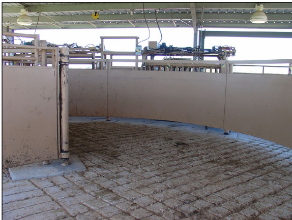
Figure 11. Textured concrete flooring in crowding pen area.

It is also useful to place non-slip mats in key areas, such as in front of the chute exit, to improve cattle traction. Mats should be heavy enough not to slide or fold readily as cattle trample over them. Textured, heavy-duty rubber mats are easy to clean and provide a durable, non-slip surface that can be moved to various flooring areas as needed.