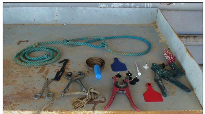
Figure 14. Supplies laid out on a working table close to the squeeze chute.

Working tables next to the squeeze chute and head gate where cattle are restrained are useful for organizing supplies. Tables provide a surface for preparing animal health products to administer, marking ear tags, writing down records, and completing other organizational tasks that take place during cattle handling. Use tables with drawers or cabinets to store extra supplies that might be needed during a cattle handling event. Be sure to return any supplies that need temperature-controlled or locked storage to appropriate locations after cattle handling is completed.