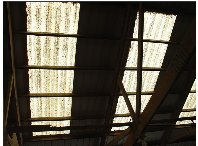
Figure 19. Translucent roof panels (skylights).