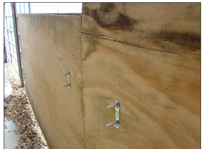
Figure 20. Protruding screws inside cattle handling paths could cause injury.