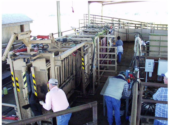
Figure 6. Slider (alley divider) extended outward between palpation cage and scale compartment.

Many additions are available that will improve the speed and efficiency of basic cattle handling facility components such as alleys. For example, a catwalk along the outside of the alley leading up to the squeeze chute enables handlers to position themselves above the cattle to keep cattle flowing down a solid-sided alley, read ear tags in advance, and apply pour-on products. Climbing up and down a catwalk all day can be tiring. Be sure to provide sturdy steps or rungs to ease the climb to and from the catwalk. Make sure it is wide enough (at least 18 inches wide) to be safe but low enough that handlers can reach over it easily if cattle only need light prodding. Locate the catwalk 36 to 42 inches below the top of the alley.