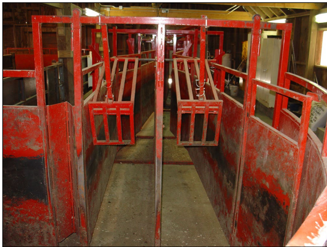
Figure 5. Double-loading alley.