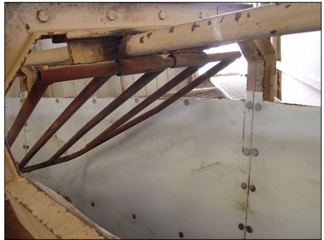
Figure 3. Backstop in alley.