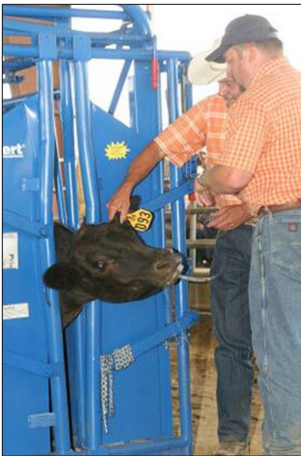
Figure 7. Squeeze chute with head catch.

Slider gates in alleys act similarly to backstops by keeping cattle from backing up. They are very effective at staging individuals for maintained flow, but they are usually manually operated and require attention from a handler. They are most effectively used at the back of permanent scales or between the chute and palpation cage. Use care when operating sliding gates to avoid being struck by a gate in motion.