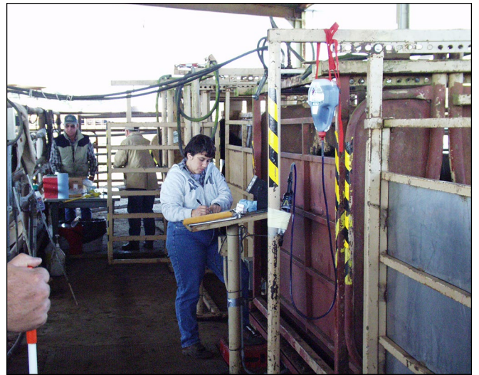
Figure 17. Separate scales compartment before squeeze chute entrance.

Fences provide the boundaries of pens and paddocks. Fencing construction and management recommendations are provided in Mississippi State University Extension Service Publication 2538 Livestock Fencing Systems for Pasture Management .