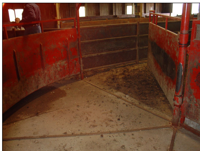
Figure 1. Crowding pen.

There are several important issues to consider when developing new, or renovating existing, animal handling facilities. The most important consideration is the intended uses or objectives. Consider whether the facility will be used to handle 30 cows and calves just a few times per year or to process truckloads of stockers each week. Efficiency refers to the number of animals that can be worked over a given amount of time and should be balanced with cost and safety.