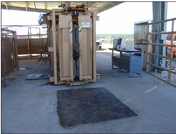
Figure 10. Non-slip mat at chute exit.

Flooring is a design issue that is often overlooked but can create safety issues for both cattle and handlers if not done correctly. Dirt floors are the most common, but in certain environments, dirt floors readily become dusty or muddy. Mud can harbor infectious diseases, and dust can aggravate the respiratory system, both leading to an increased incidence of disease. Concrete flooring is a good alternative to dirt floors but must be textured to reduce slipping. Cattle that slip on smooth concrete flooring can be severely injured and pose an injury risk to the people handling them. Concrete can be textured as it is poured or after it is poured. Planning ahead will save money and time because it is easier and cheaper to texture concrete while it is being poured.