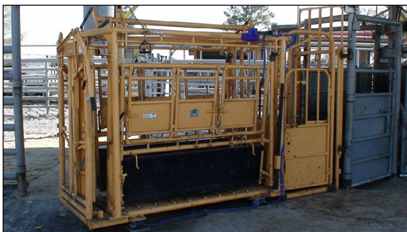
Figure 16. Scales mounted under squeeze chute.