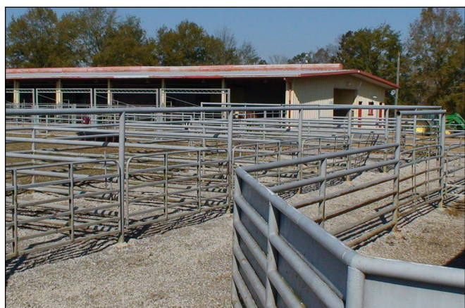
Figure 9. Sorting pens.

Set up pens off of a lane leaving the chute so that the cattle can be sorted immediately after processing. Make sure the gates hinge on the proper side so they will swing in the desired direction to move cattle directly into pens. The number and sizes of sorting pens needed depends on the number and sizes of cattle to be handled. Larger operations may need more sorting pens than smaller operations.