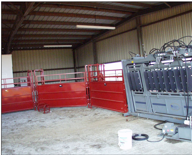
Figure 2. Curved, solid-sided alley.

Crowding pens typically have a gate that swings around behind the cattle to guide them single-file into the working alley. Gate stops at set intervals allow the sweep gate to be held securely in place against cattle pushing back against it. The handler is able to push from behind the gate and use the self-latching gate stops to protect against the gate being opened backward without the handler deliberately releasing the gate stops. A solid sweep tub gate and side panels are strongly recommended both for safety and to shield the cattle from viewing any distractions outside the pen.