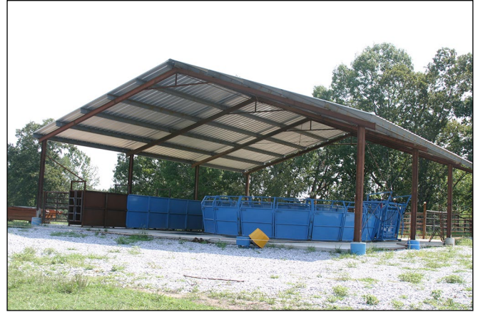
Figure 18. Covered cattle handling facilities.

Safety of the animals and handlers is the primary consideration in developing handling facilities. No matter how efficiently a facility functions, it is unacceptable if design flaws lead to injuries in handlers or animals. Design facilities to avoid protrusions or sharp edges that might cause abrasions or lacerations. Make sure gaps and openings in facility features do not lend themselves to body parts becoming trapped, which could lead to broken bones or choking. Also ensure that safety escapes for handlers are strategically located throughout the facilities.