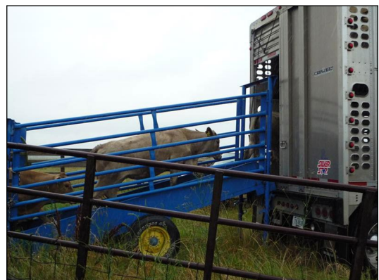
Figure 12. Portable loading ramp.

Loading and unloading ramps are used to move cattle from ground-based handling facilities to trailers for transportation and vice versa. They can be permanent or portable. Ramp heights may need to differ depending on the type of trailers used. Maintaining loading ramps of different heights or an adjustable-height loading ramp can facilitate a variety of transportation options. If tractor-trailers are to be unloaded, these ramps should be single file (30 inches for mature cattle) to accommodate the 30-inch-wide rear doors standard on most US tractor-trailers. Ramps can be narrowed to less than 30 inches when only calves will be handled. To avoid cattle striking the sides of the trailer during loading, ramps should not be wider than the trailer opening. Self-aligning dock bumpers and telescoping ramp panels are useful for blocking gaps from misaligned trucks. Injuries can occur if unloading ramps are too steep. Target a loading ramp height of 20 degrees for permanent ramps and 25 degrees for adjustable ramps. Grooved stair steps are recommended for concrete ramps. Design steps to be 4 inches high and 12 inches deep. Table 3 outlines recommended loading chute dimensions.