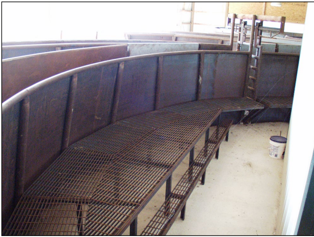
Figure 4. Catwalks along outside of alleys.