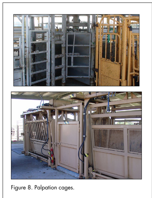
Figure 8. Palpation cages.

A palpation cage is an extension of the squeeze chute with a door that swings across the alley. It allows easy and safe access to the rear of cattle restrained in the squeeze chute. It is especially important for cow-calf operations where pregnancy diagnosis and other reproductive management techniques are frequently used.