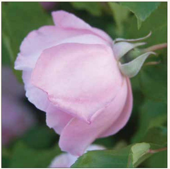
'Duchesse de Brabant' is suitable for smaller garden spaces, with a graceful spreading growth habit and abundant foliage. Bloom is continuous with highly double, cupped flowers. This rose needs a warm, sunny location to thrive.