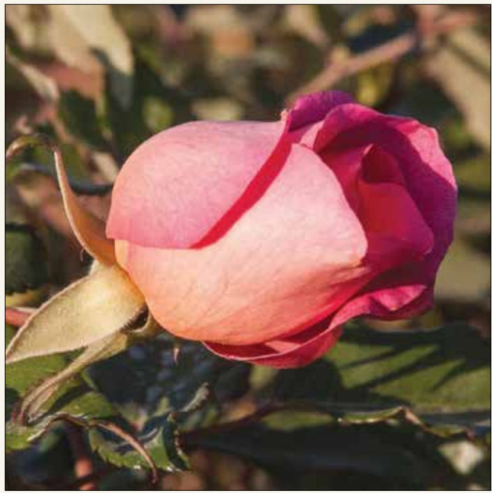
'Comtesse du Cayla' is useful for small garden spaces. Bloom is continuous, and the flowers are almost single and fragrant.

Climbing 'Cécile Brünner' is a sport of 'Cecile Brünner' (the "sweetheart rose"). It is a very large and robust climber that requires a stout arbor for support. This cultivar is a spring-only bloomer, but it features highly abundant blooms of small flowers. The slightly shade-tolerant foliage is healthy, abundant, and fills out early enough to partially obscure blooms.