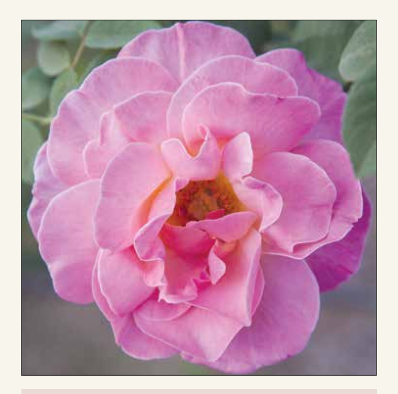
'Dr. Eckener' is a large shrub with an open, coarse branching structure with coarse foliage and vicious thorns. It does not serve well as a screening shrub, but it does bloom with repeat cycles, and the blooms are very large and fragrant. It has some shade tolerance.

Hybrid rugosa roses are a late old garden rose development derived from hybridization of rugosa roses with other garden roses. Rugosa species and varieties are from Japan, Korea, and northern China, and possess good cold hardiness. Hybrid rugosa roses resemble rugosa roses, but display flower colors and other traits common to the nonrugosa parent. The roses are shrubby with stout thorns. The leaves are apple green with rough leaf surfaces and distinctly patterned venation. Flowers are large, usually blooming repeatedly and often followed by attractive hips in the fall.