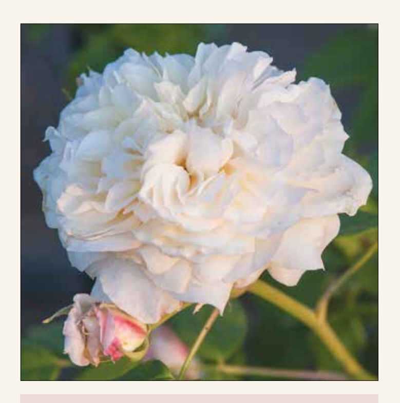
'Céline Forestier' has long, arching canes that can be trained to a pillar or fence. Bloom is continuous with highly double flowers.

Tea roses are an important parental rose line used in the development of the hybrid tea. These roses are thought to be descended from a cross between R. gigantea and R. chinensis by Chinese breeding efforts. Early cultivars arrived in Europe via plant collectors in the early 1800s. Roses were probably shipped back by the East India Company that imported tea from China. It is conjectured that sailors on the trading ships called them "tea-scented roses," and thus, the name evolved. Some rosarians claim the blooms have a tea-like fragrance. They tend to be less cold-hardy than many classes of roses, but they are hardy in the southeastern United States. The growth habit is more slender than hybrid tea roses and retains the graceful, twiggy form of China roses. They are repeat bloomers. Flower form can be diverse, but elongated, refined, high-centered buds distinguish many cultivars. These buds became popular with Victorians to wear in buttonholes.