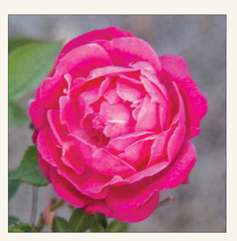
'Cramoisi Supérieur' is a compact, tidy shrub that is a small-sized screening shrub in the VMRG. Bloom is continuous with non-fragrant, semi-double flowers arranged in large clusters.