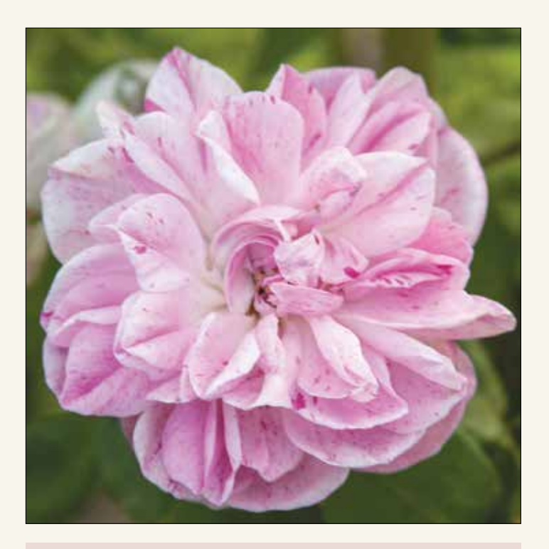
'Ferdinand Pichard' is a large shrub with arching canes. Its unpruned growth habit is rather untidy. Bloom repeats in cycles with flowers that are white and red striped, cupped, and fragrant.

Finally, there are species roses that have become well-known landscape plants in their own right. Rosa banksiae lutea is a species rose form of unknown ancient garden origin brought to the southeastern United States from China in the early 1800s. It has flourished in areas with mild climate. Rosa banksiae has yellow or white, double- or single-blooming forms, but the one most often seen in Mississippi is the double yellow form, called 'Lady Banks' rose ('Yellow Banksia' or R. banksiae lutea ). This very large climber has a light, airy, and elegant growth habit and few thorns. The leaves are small, semi-evergreen, and very healthy.