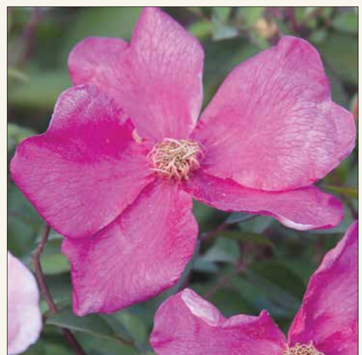
Rosa chinensis mutabilis ('Mutabilis', butterfly rose) is an ancient garden hybrid that serves well as a medium to large screening rose. The abundant, healthy foliage and twiggy growth make this a good landscape rose. Bloom is continuous the entire season with abundant single, non-fragrant flowers. Bloom color intensifies with age, instead of fading.