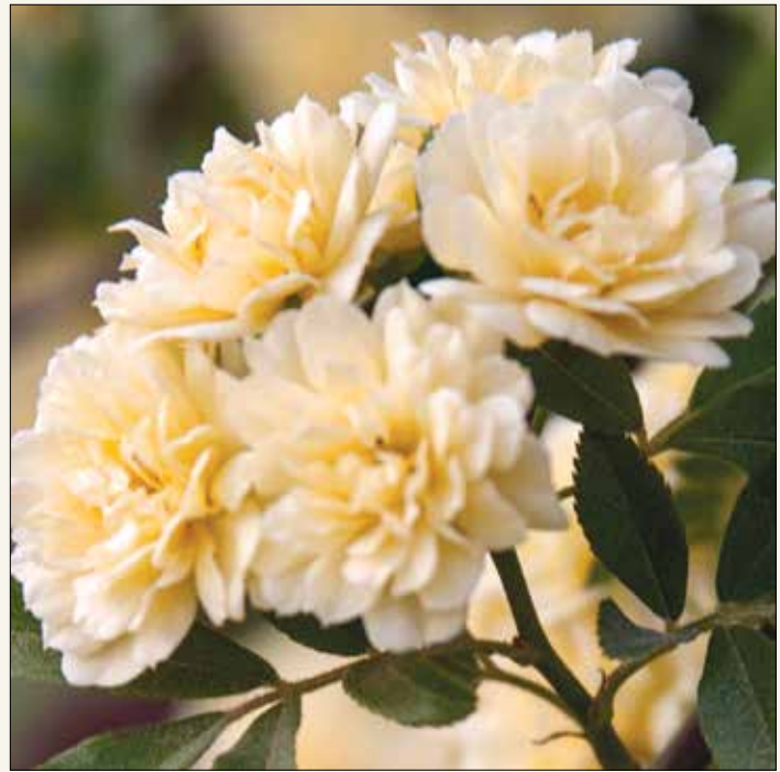
'Lady Banks' rose is the first rose to bloom each spring. It blooms only once per year, but the mass of small, yellow double blooms stops traffic with its massive display.