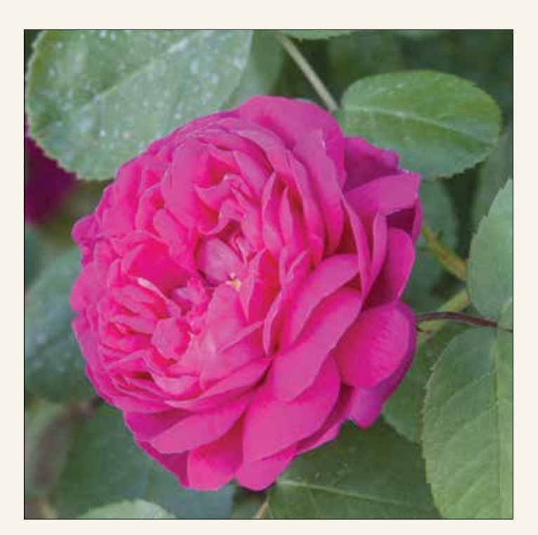
'Rose de Rescht' is an undated rose that will suit small garden spaces well and that is known to have some shade tolerance.

Alba roses are ancient roses grown in England during the Middle Ages. The robust shrubs grow to 6 feet or more. Foliage is typically a soft, matte gray-green. These roses bloom in the spring with delicate pastel blooms.