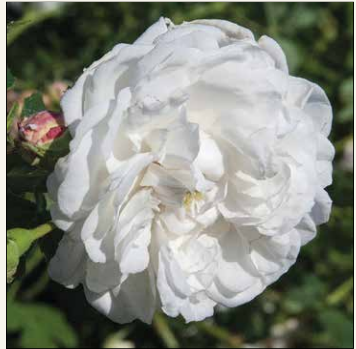
'Madame Plantier' is a spring-blooming rose with some shade tolerance. Growth is very vigorous, and adequate space for full growth is highly recommended. It makes an excellent dense screening shrub. The canes are long and flexible with few thorns, making it trainable to fences or pillars. However, this would require strict diligence to keep the growth under control.