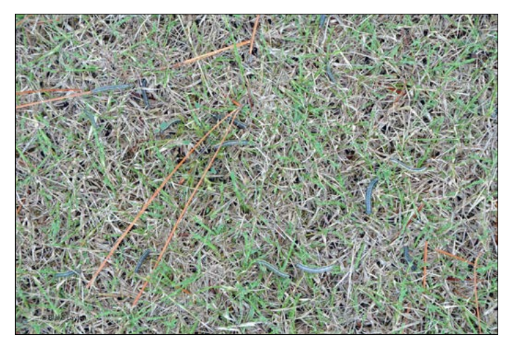
Treatment is recommended when counts exceed three caterpillars per square foot (do not count caterpillars that are less than one-fourth inch long).

The best way to avoid losing a cutting of hay to fall armyworms is to visit fields every 3 or 4 days and check for fall armyworms. Get out of the truck, get down on your hands and knees, and look closely. Scout for fall armyworms by vigorously ruffling the grass with your fingers and carefully counting the larvae that have fallen to the ground in a 1-square-foot area. Do this at several locations in the field and average your results. Treatment is recommended when counts exceed three caterpillars that are one-fourth inch or longer per square foot. Be sure to look carefully for small caterpillars. You want to find and treat them when they are small because small caterpillars are easier to control and, more importantly, have not eaten nearly as much as they are going to eat.