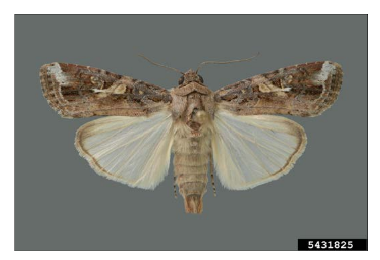
Male fall armyworm moths have light-colored markings on their forewings. Forewings of female moths are more uniformly gray. Moths of both sexes have light-colored hindwings.