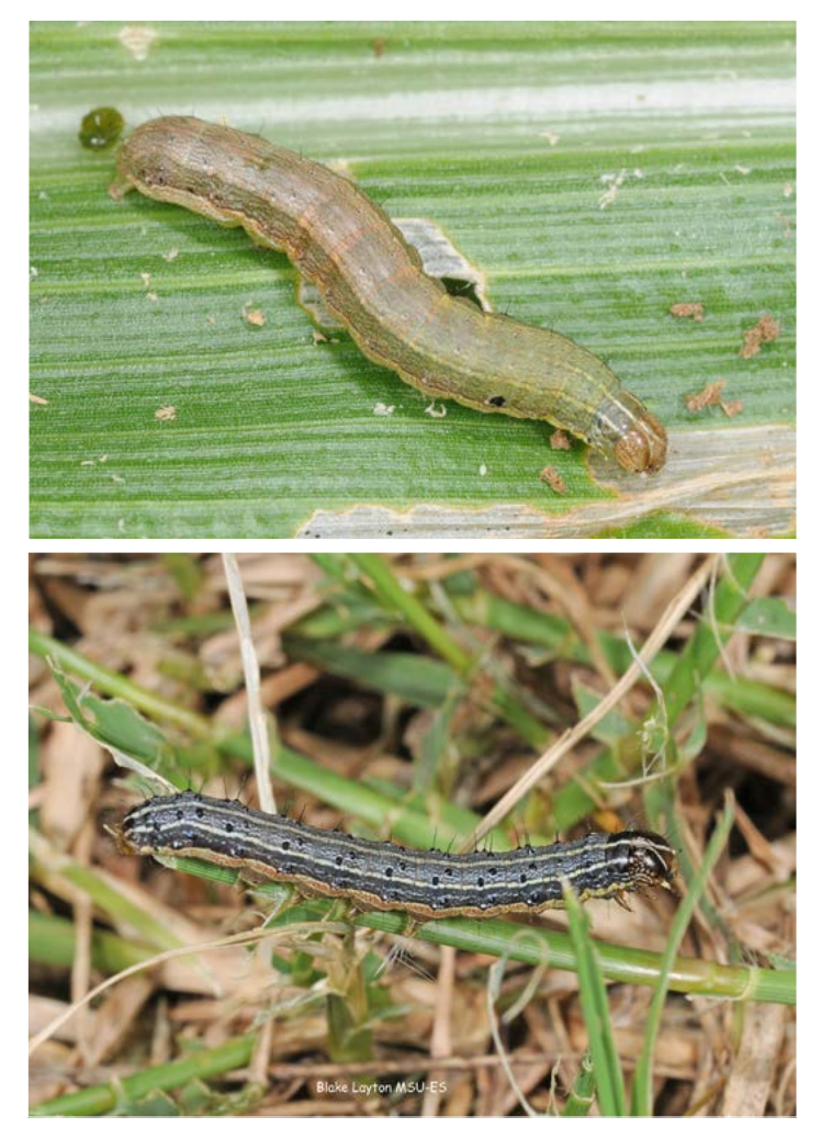
Fall armyworm caterpillars vary considerably in color, ranging from light green to nearly black.

Fall armyworm caterpillars vary in color depending on their stage of development and diet. Most are green or tan, but some can be dark brown to almost black, especially late in the year when numbers are high. The body is punctuated with dark spots. Most notably, there are four spots at the rear of the body that form a square. Mature caterpillars are about 1½ inch long and are mostly slick-bodied with a few small, stiff hairs visible up close. The head capsule ranges from light brown to dark brown, and, on larger specimens, there is a distinct white inverted Y shape on the head. This Y and the square of four spots on the rear are two of the best ways to identify fall armyworm caterpillars.