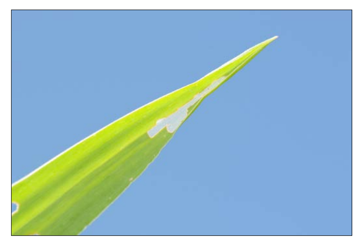
"Windowpanes" in grass blades are an early warning sign of fall armyworm infestations. These are caused by newly hatched caterpillars feeding on the undersides of leaves and leaving the clear, upper epidermis intact.

or white. When large numbers of small larvae are just beginning to damage a field, the grass often has a subtle "frosted" appearance because of these windowpanes. This is easier to see on the wide leaf blades of barnyard grass, which is a favorite food of fall armyworms. Learning what this looks like on barnyard grass can help you recognize it on bermudagrass. Recognizing this early sign of infestation can help save a cutting of hay.