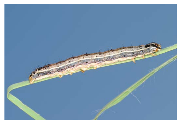
Fall armyworm caterpillars have smooth bodies with a few stiff hairs. Note the inverted, white Y or V shape on the head. All caterpillars have this structure, but it is particularly obvious on fall armyworms.