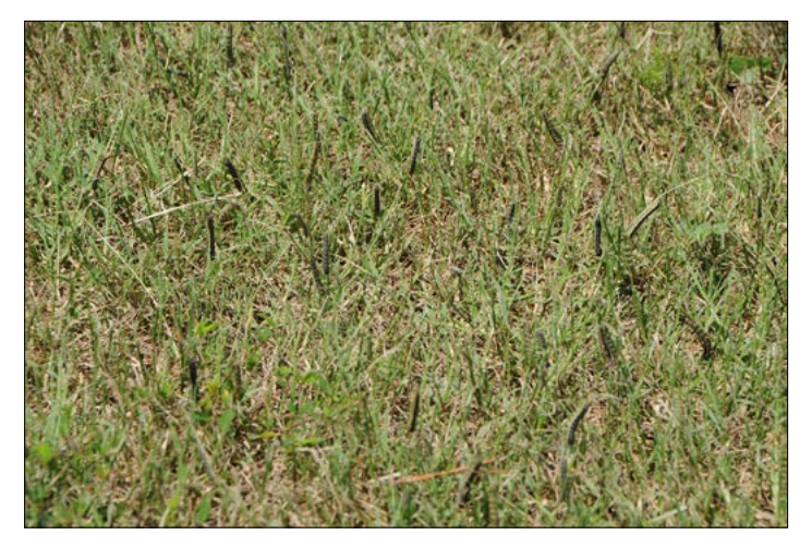
Heavy infestations of big caterpillars can consume large amounts of grass in a single day.

Like most caterpillars, fall armyworms do about 80 percent of their eating during their last two to three days as larvae—when they are "teenage" caterpillars. Therefore, if a field has reached threshold on Friday but is not scheduled to be cut until the next week, it needs to be treated as soon as possible. A moderate to heavy population of large fall armyworm caterpillars can eat a whole field of grass in just a couple of days. Be sure to pay attention to preharvest intervals when choosing an insecticide to use on a field that is near cutting!