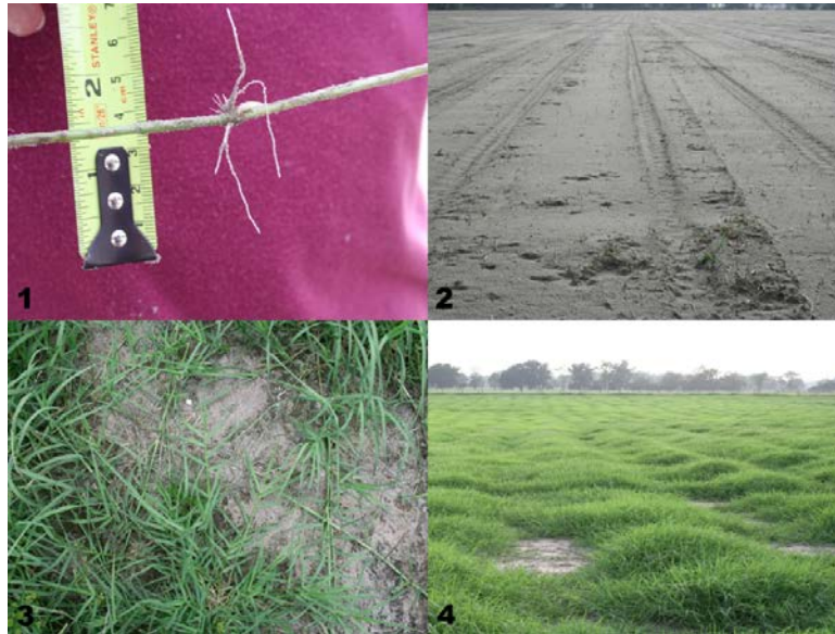
Figure 1. Steps to a successful establishment of hybrid bermudagrass: 1) Select a good sprigging material (regrowth after one week), 2) prepare a firm seed bed, 3) reduce weed competition, and 4) provide good fertilization for adequate growth.

recommendations or consult Extension Publication 1532 Weed Control Guidelines for Mississippi.