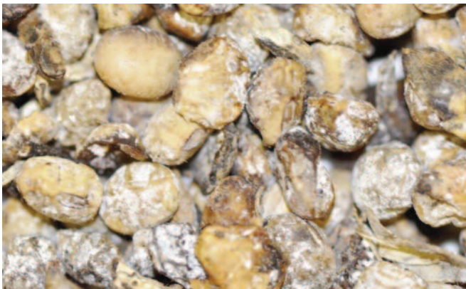
Figure 6. Damaged soybeans that were picked dry and then were water damaged. Note the mold growth on the outside of the soybeans.