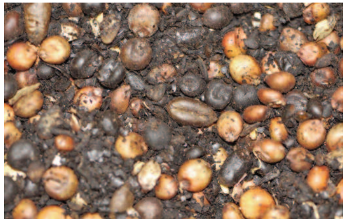
Figure 4. Milo blended with damaged milo and soybeans. Note the black-colored milo grains indicative of heat damage which renders the nutrients in those grains indigestible.

The steps in properly feeding damaged milo are similar to feeding damaged corn. Inspect the feed before use. If mold or damage is present, obtain a sample for nutrient analysis and mycotoxin screening (Figure 4). As with corn, sprouted milo can be fed to cattle without any adverse affect. However, the conditions that favor sprouting can favor mold growth. Storage of wet milo can also lead to spoilage and potential nutrient indigestibility.