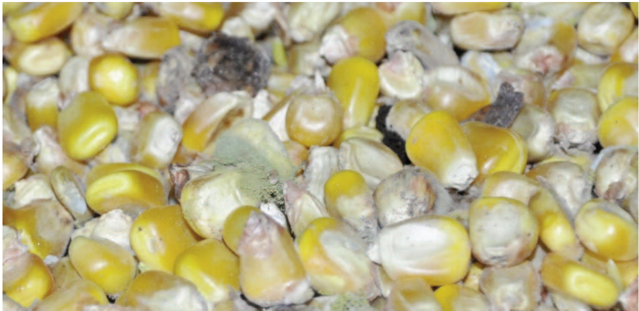
Figure 3. Mold spores are apparent on this flood-damaged corn.