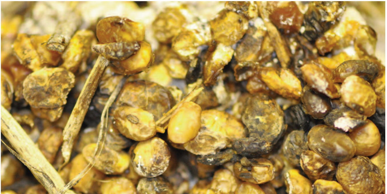
Figure 5. Damaged soybeans from a farm in South Central Mississippi. Note the damage on the grains and several darker grains that are almost black. Those indicate heat damage that makes the nutrients in the soybeans essentially indigestible.

before purchasing or feeding any damaged soybeans (Figures 5 and 6). The nutrient analysis will help determine feeding quality and allow for appropriate diet formulation.