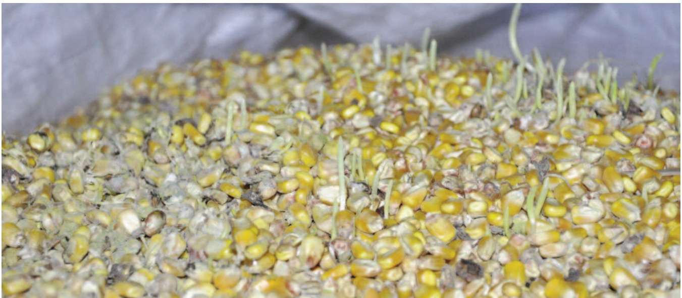
Figure 2. Corn from the same bag as in Figure 1. Mold growth and damage is apparent on corn from deeper within the bag.