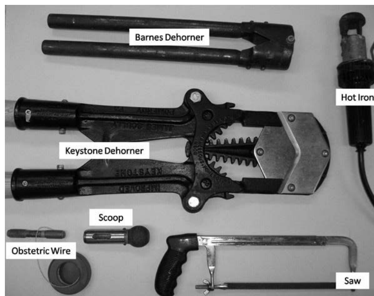
Figure 2. Dehorning tools.