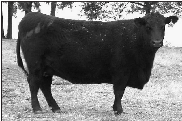
Figure 3. Body condition scores and descriptions for beef cattle.

The overall appearance is blocky with extremely wasty and patchy fat cover. The tailhead and hooks are buried in fatty tissue with fat pones protruding. Bone structure is no longer visible and barely palpable. Large fatty deposits may even impair animal mobility.