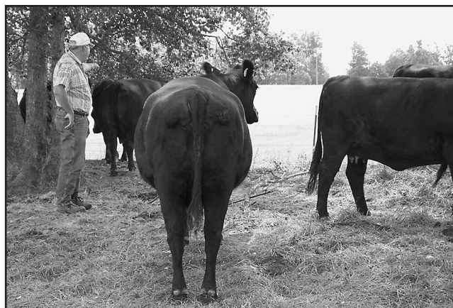
Figure 1. Beef cattle producer body condition scoring a herd at pasture.

Two animals with the same body condition score may have dramatically different live weights. Similarly, cattle with the same live weight may have distinctly different body condition scores. Weight differences between condition scores vary depending on the score and where the animal is in the production cycle. These weight differences often range from 70 to 140 pounds. Percentage body fat associated with each distinct body condition score appears in Table 1 .