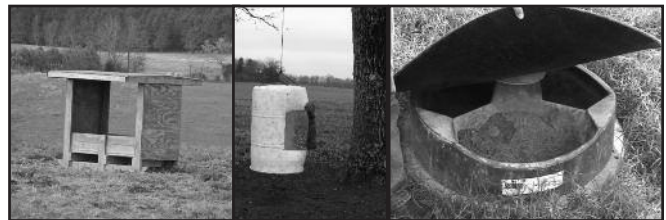
Examples of mineral and vitamin supplement feeder designs.

Many different mineral and vitamin supplement feeder designs are available. Examples are shown below. Consider differences in protection of the supplement from the environment, quantity of supplement the feeder can contain, ease of moving the feeder, and feeder durability. Strategic placement and positioning of open-sided mineral and vitamin supplement feeders can lessen weather effects on the supplement. For illustration, if precipitation most often falls and blows from one direction, then turning open sides of mineral and vitamin supplement feeders away from this direction is warranted.