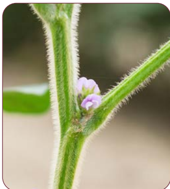
R1 First flower anywhere on the plant.