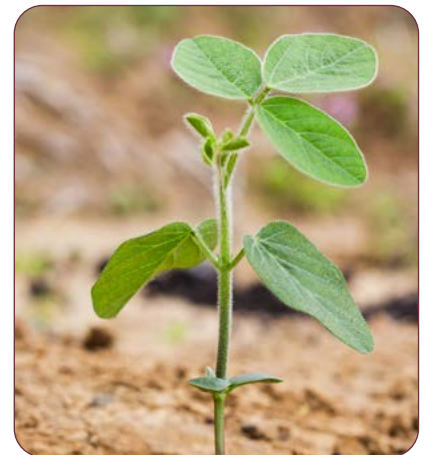
V1 One node with fully developed trifoliate leaves.