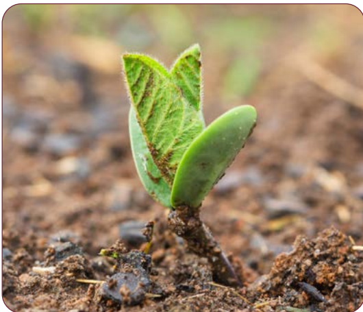
VE Cotyledons emerged through the soil surface.