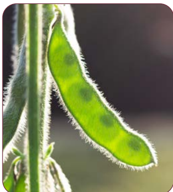
R5 Beginning of seed development with seed \frac{1}{8} inch long in a pod at one of the upper four nodes.