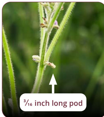
R3 \frac{3}{16} -inch-long pod in one of the upper four nodes.