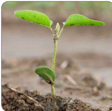
VC Cotyledons and unifoliate leaves fully expanded.