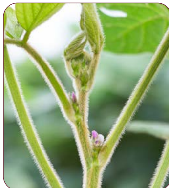
R2 A flower at one of the two uppermost nodes.