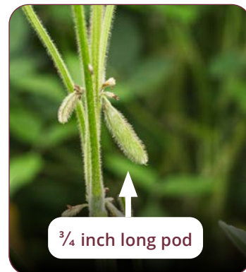
R4 \frac{3}{4} -inch-long pod in one of the upper four nodes.