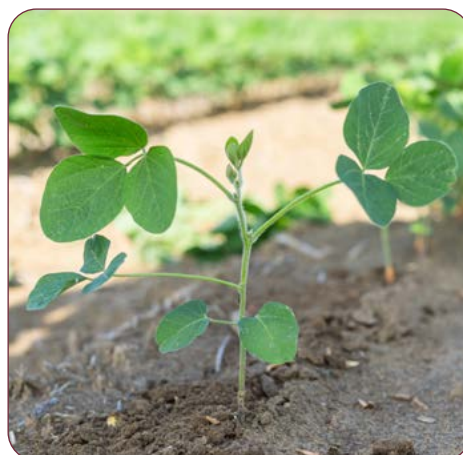
V3 Three nodes with fully developed trifoliate leaves.