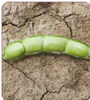
R6 Full seed with pod containing seed that completely fill the pod cavity at one of the upper four nodes.