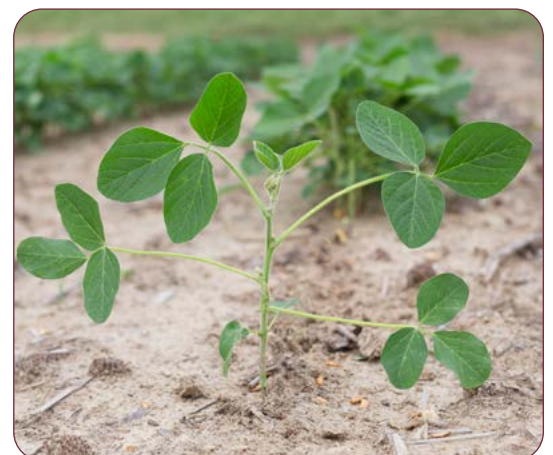
V(n) (n) number of nodes with fully developed trifoliate leaves.