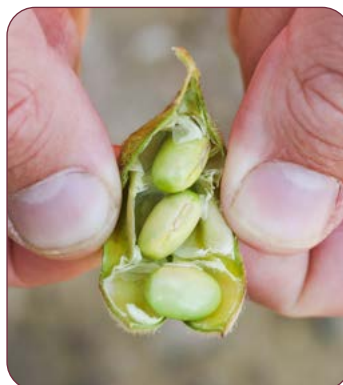
R6.5 Pod containing seed that completely separate from the protective membrane of the pod wall at one of the upper four nodes.