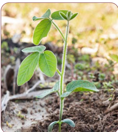
V2 Two nodes with fully developed trifoliate leaves.