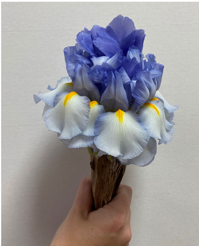
Completed Dutch iris composite flower.