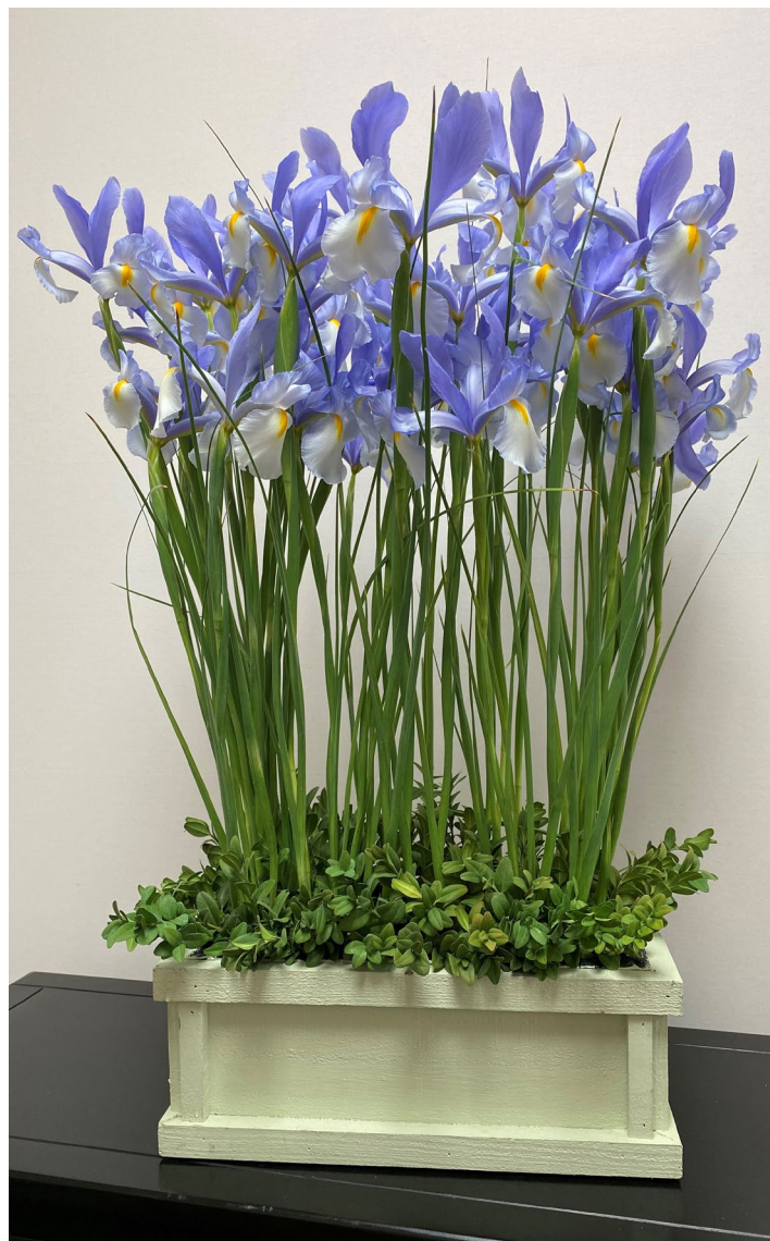
Dutch irises arranged in a wooden planter box.

After harvesting, place iris stems upright into a cooler set at 33–35°F (0.5–1.7°C) to prevent dehydration. Do not store stems for more than a week because prolonged storage can result in the flowers failing to open. If flowers start to dehydrate, place them into a bucket of water with flower food to rehydrate them.