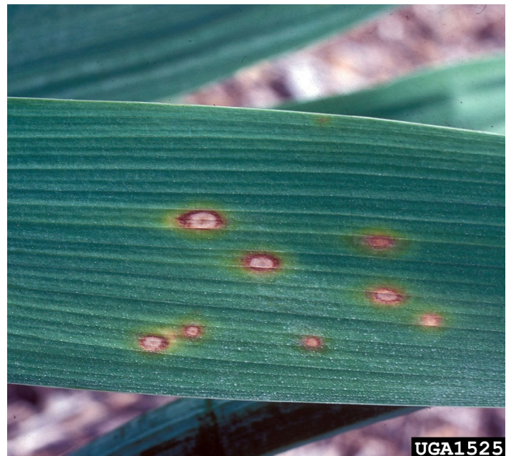
Iris leaf spot symptoms on an iris leaf.

Good cultural and sanitation practices will help to prevent leaf spot. It is important to remove and destroy the infected parts of the leaves as soon as the disease begins to develop. When removing diseased plant tissues, sanitize tools to prevent spreading the disease between plants. Collect and dispose of infected plant debris in the fall. If cultural practices fail to keep the disease in check, fungicide treatments have been reported to be effective.