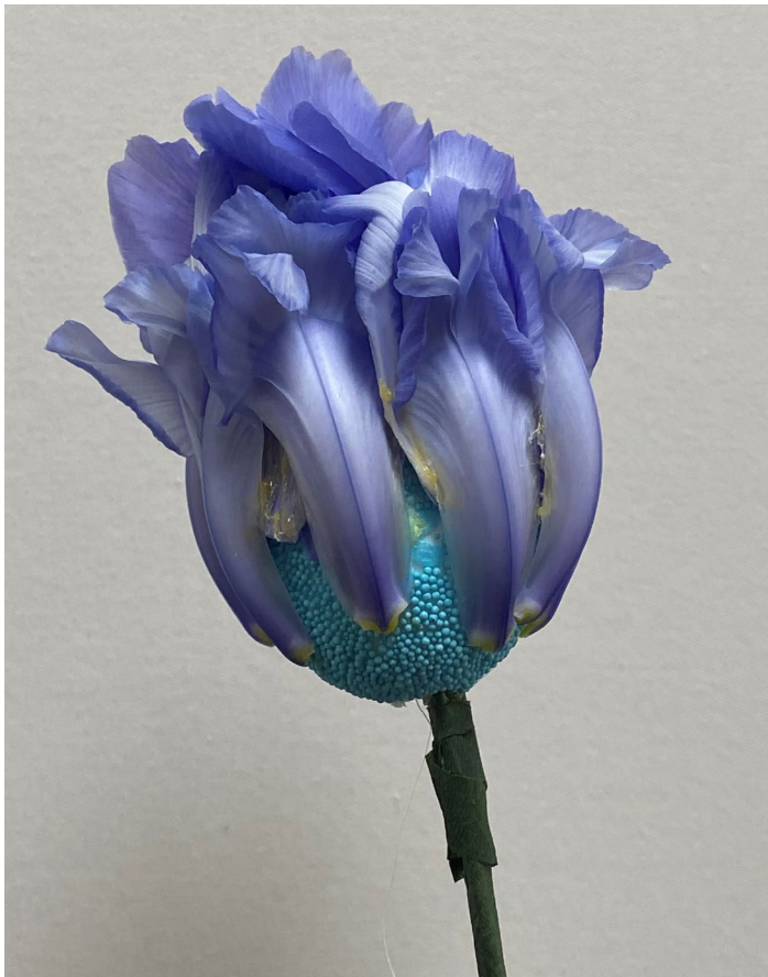
Dutch iris composite flower in process.