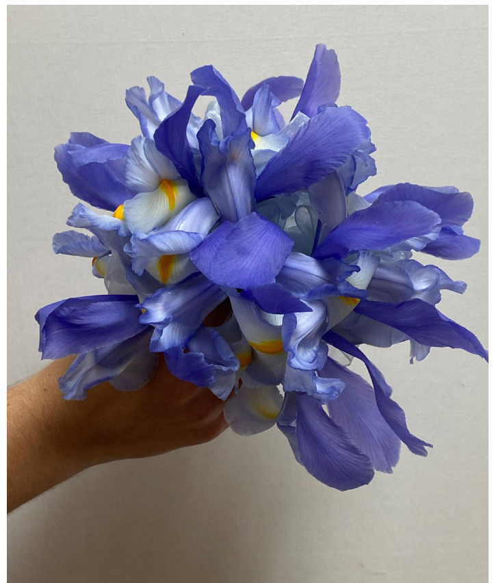
Dutch iris bridesmaid's nosegay.

This simple design has a spontaneous effect, and its design time is relatively quick. Once completed, thoroughly mist it with an anti-transpirant solution, allow the surfaces to dry, and package it in a plastic bag. Do not allow the plastic film to rest on the petals because this may allow gray mold to proliferate. Store the bagged bouquet in refrigeration. It can remain fresh for up to 3 days and still provide adequate display time for a wedding or event.