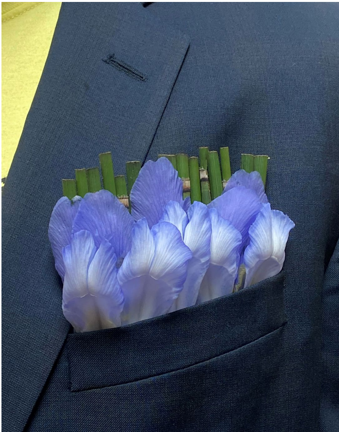
Pocket square example using standards and style arms.