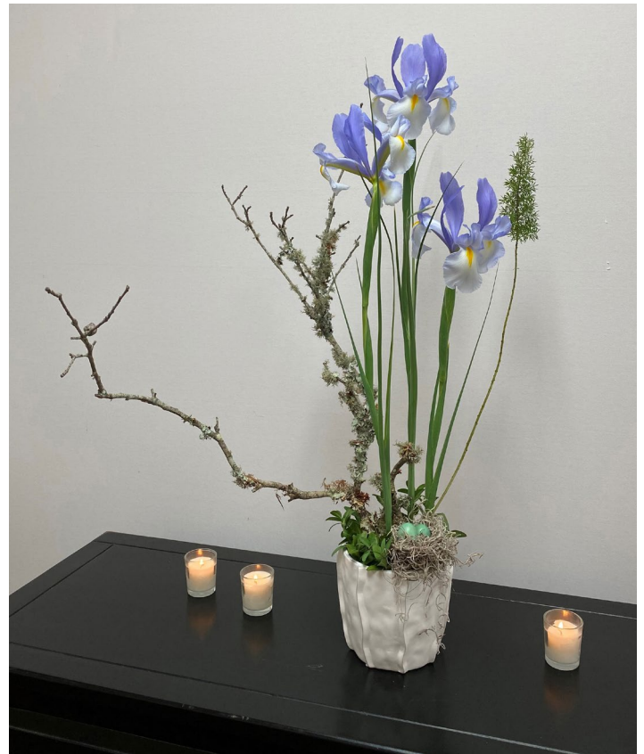
Asian-inspired table centerpiece.

We made a small nest of Spanish moss ( Tillandsia usenoides ) and anchored it into the floral foam using 20-gauge wire pins. A few artificial robin eggs complete the design's base. Three votive candles suggest this combination as a table centerpiece suitable for an after-6-o'clock event.