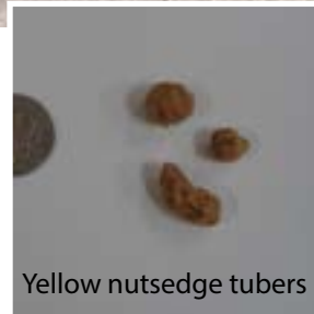
Yellow nutsedge tubers

Remember: One weed seed is enough to start an infestation.