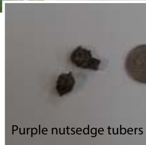
Purple nutsedge tubers