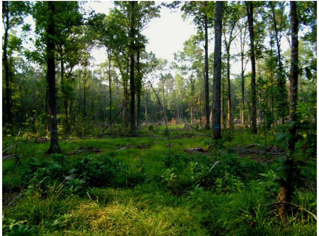
Figure 5. (Top) Herbaceous competition on a bottomland site 6 months after full exposure to sunlight and (bottom) herbaceous competition on the same site in a shelterwood treatment area where sunlight was limited to approximately 50 percent.