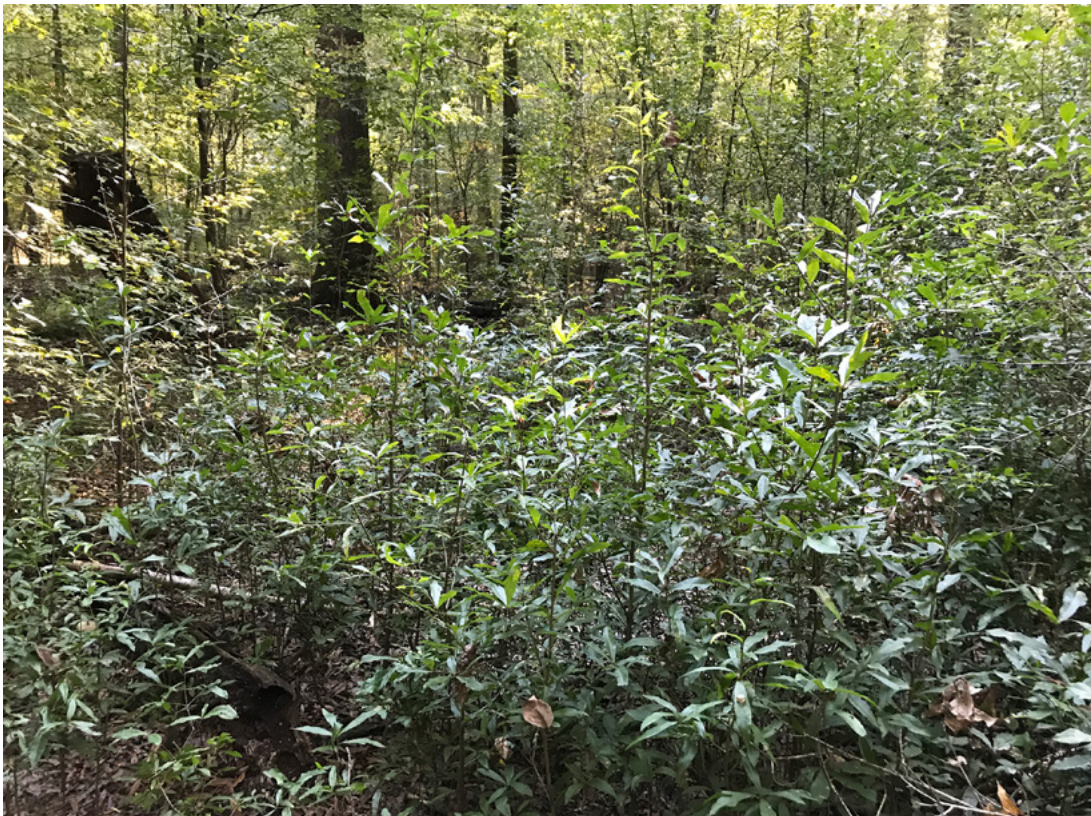
Figure 3. Advanced water oak regeneration. These seedlings average 3 to 4 feet tall and are capable of successful competition with other post-harvest vegetation.

Because of their established root systems, these seedlings are much better positioned to compete for growing space in newly regenerated stands. Advanced regeneration is the most important element of successful bottomland shelterwood efforts.