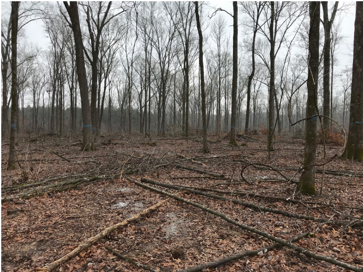
Figure 8. A modified oak shelterwood after a seed cut. Notice the lack of midstory stems resulting from a hack-n-squirt treatment 1 year before.

The shelterwood system consistently provides the best results for establishing natural regeneration in bottomland oaks. The time from start to finish varies, ranging from 2 to 5 years and, in some cases, 10 years or longer to establish oak advanced regeneration large enough to compete when the residual overstory is removed. Multiple MSU research projects have found that the shelterwood process yields