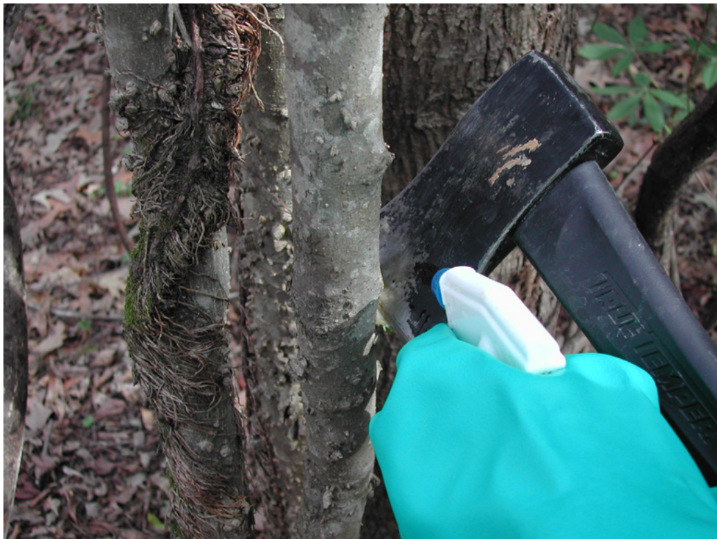
Figure 6. Control of undesirable hardwood stem with herbicide using the hack-n-squirt method.

When overstory removal increases light availability to the midstory and understory, competing vegetation responds by either germinating or increasing leaf production. These species are often able to outcompete freshly germinated seedlings and small advanced regeneration. Thus, the first step in a shelterwood operation is removing small-diameter stems of undesirable species in order to reduce competition and promote desirable regeneration by increasing light availability. In stands with large numbers of these non-merchantable trees, the process is usually accomplished using stem injection, hack-n-squirt, or basal bark herbicide applications. Herbicides used in these treatments are typically soil-active; be very careful not to allow the herbicide to spill, drip, or run out/off of treatment surfaces. For more specific information on these applications, please read MSU Extension Publication 2942 Tree Injection for Timber Stand Improvement . For best results, injection should take place during the year preceding the first overstory removal step in the shelterwood.