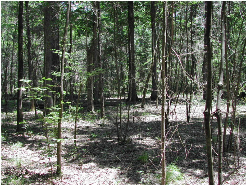
Figure 7. A bottomland hardwood stand undergoing midstory control through hack-n-squirt with imazapyr. Before (top) and 1 year later (bottom) demonstrate the substantial increase in available sunlight.