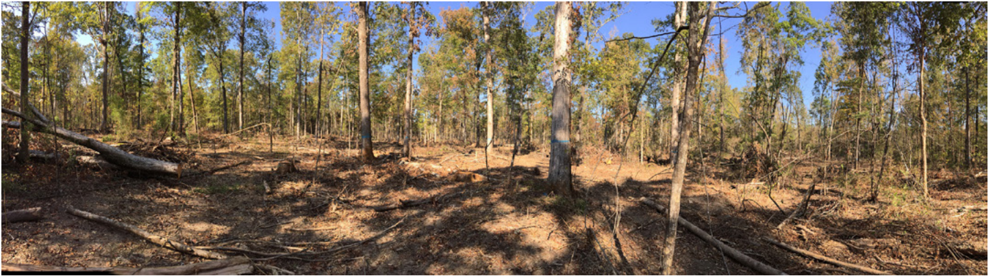
Figure 1. An oak shelterwood after the seed cut. Approximately 50 square feet of oak basal area remains.

Regenerating bottomland oaks can be difficult and carries a set of problems unique to bottomland sites. The high costs of artificial regeneration deter most landowners, yet they rarely make provisions for natural regeneration before harvesting these stands. An oak shelterwood system can effectively establish vigorous oak advanced regeneration in bottomland hardwood stands. It provides an affordable means of reestablishing a stand using existing trees as a seed source.