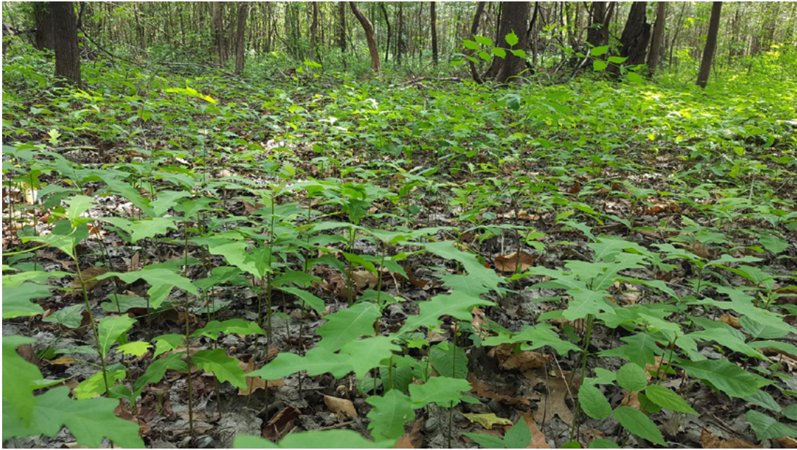
Figure 2. Freshly germinated Nuttall oak seedlings. Even though several thousand seedlings per acre have germinated, very few will survive past the first growing season.