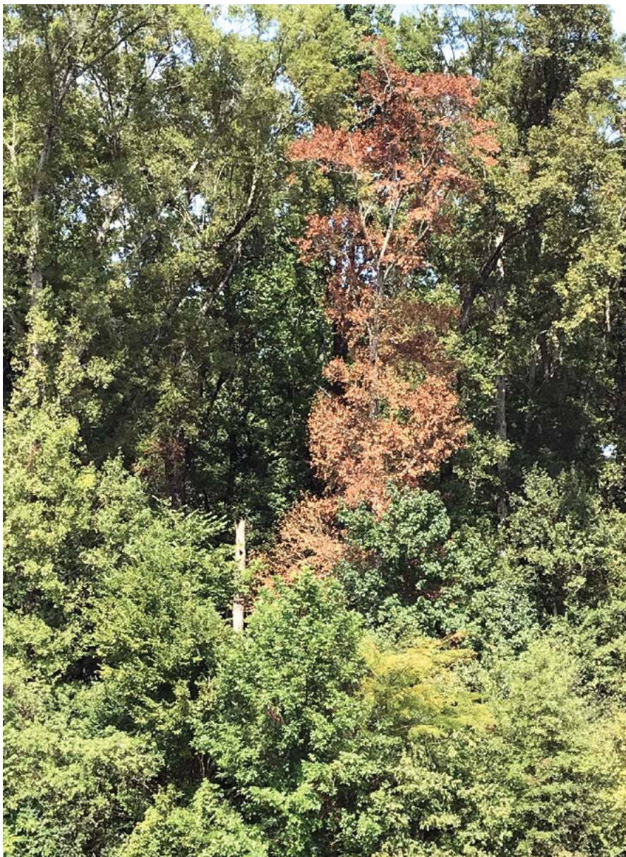
Figure 3. A suppressed water oak is not able to contend with flood waters.

Mortality in freshly planted seedlings is usually high in all but the shortest floods. This greater level of mortality results from a lack of nutrient reserves in root systems and the inability of newly planted seedlings to withstand longer floods. U.S. Forest Service research on the effects of the 1973 Mississippi River flood found that newly planted hardwood plantations were severely impacted with the mortality of various species, reaching levels as high as 100 percent by mid-June. Conversely, plantations of established 1-year-old or older seedlings/saplings/trees did not exhibit high levels of mortality if species were appropriate for the site. However, the 1973 flood reached neither the depth nor the duration of more recent Mississippi floods. Much of the 1973 flooding did not occur until March/April and receded May through late June on many sites. Consequently, tree