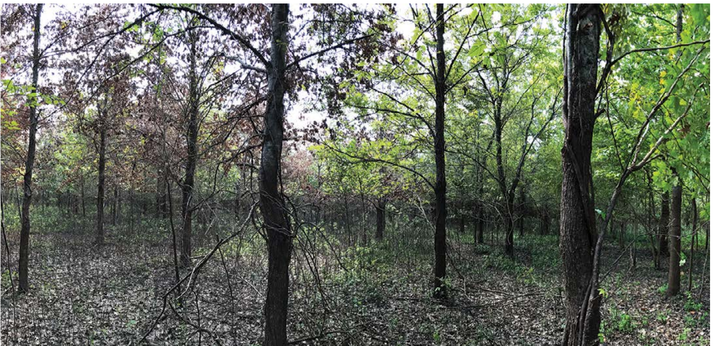
Figure 5. This is an example of Shumard and Nuttall oak planted on Mahannah Wildlife Management Area near Redwood, Mississippi. Shumard oak (left side) is not adapted to wet, heavy clay soils, and 100 percent mortality occurred during a flood.

Flooding damage to trees is typically the result of injury to root systems. Often, this damage escapes immediate observation and accumulates gradually over time. Physical signs like crown dieback are obvious indicators. It is often impossible to provide a complete long-term prognosis of flood damage using only observable physical indicators. In many cases, root damage will continue to influence overall decline in tree health. This decline may not become apparent for several years. More immediate symptoms (often only manifesting in major flooding events) may occur in the form of leaf chlorosis (yellowing), smaller-than-normal leaves, a complete lack of foliage, death of small branches/twigs, and epicormic sprouting (dormant buds that emerge as branches in stressful events).