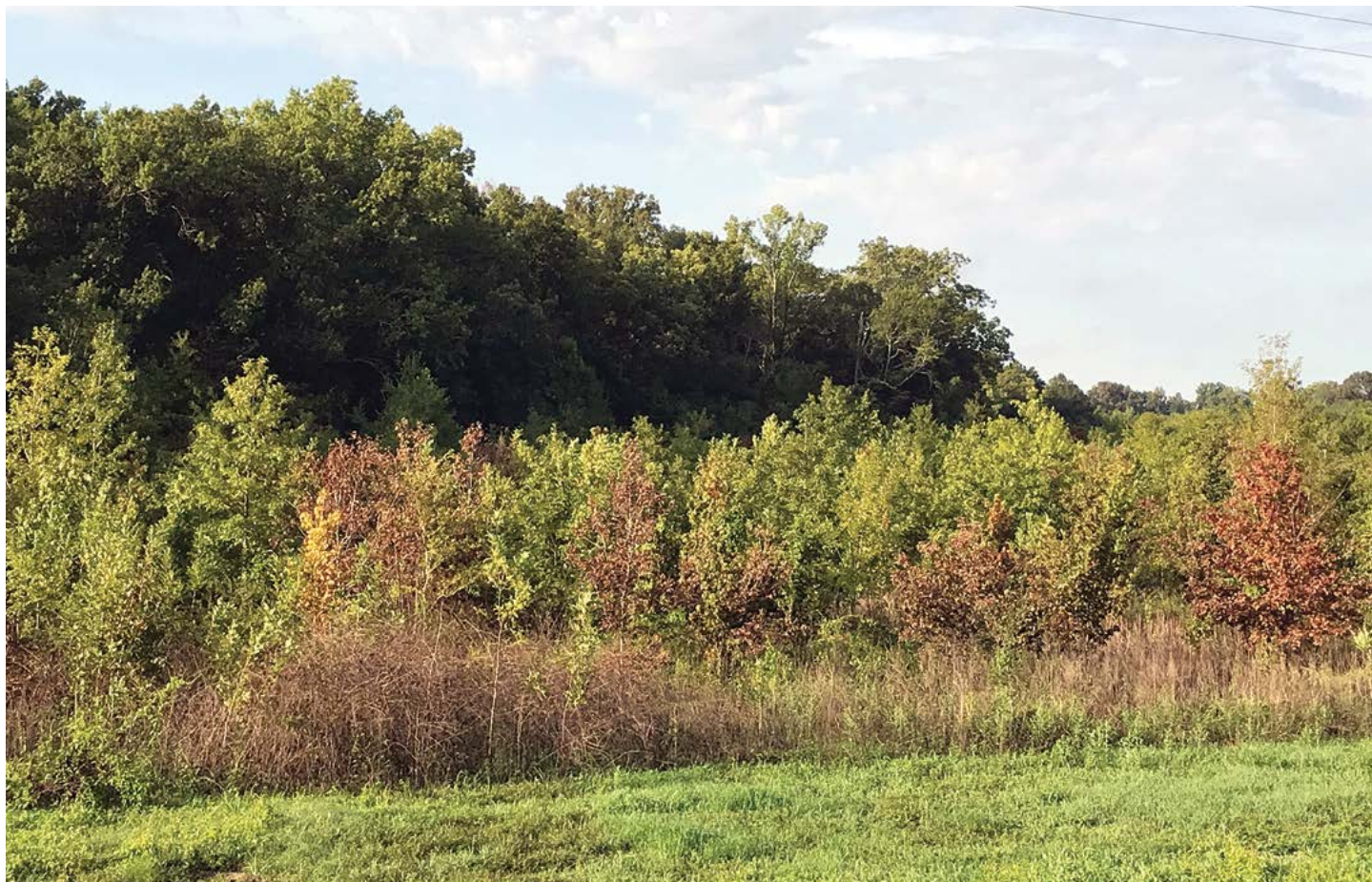
Figure 2. Long-duration flood damage can be seen in the form of chlorotic and necrotic leaves in these sapling-sized Nuttall and water oaks. However, these trees recovered, and overall stand mortality was low.

Tree age and health also have serious implications regarding the level of flooding damage sustained. Typically, trees in the sapling to mature age range are the least susceptible to damage from flooding (as long as the species is appropriate for the site) (Figure 2) (Table 2). While these trees do experience some level of root and/or crown damage, they often are able to overcome this setback, and mortality is relatively limited. Conversely, mortality of freshly planted seedlings and over-mature trees is usually higher.