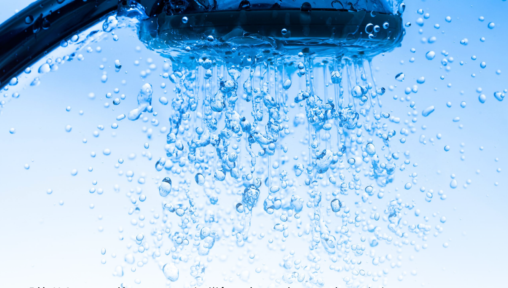
Table 11. Average monthly gross compensation ($) for employees and contractors by organization type.