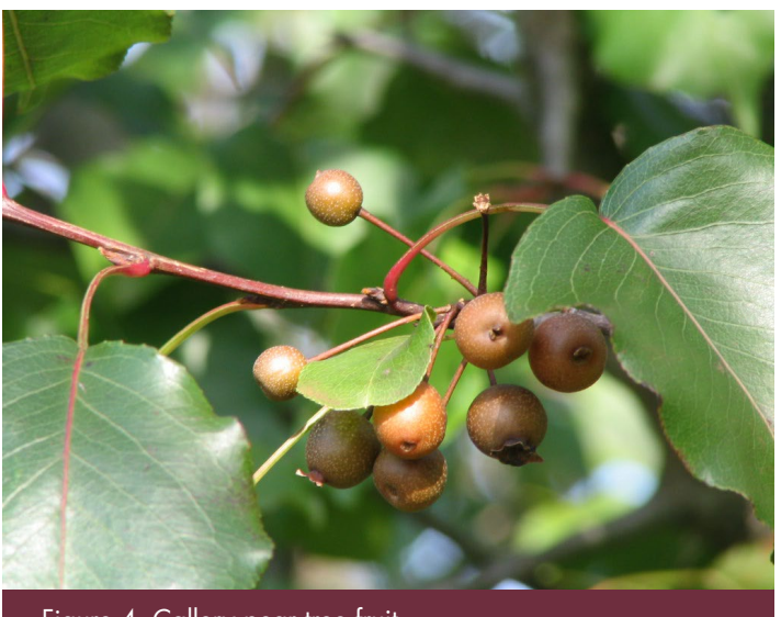
Figure 4. Callery pear tree fruit.

Flowering occurs before leaves emerge, typically in March in Mississippi. Flowers are white, up to 1 inch in diameter, and have smooth inflorescences (corymbs). This feature is the primary appeal for callery pear as an ornamental. Flowers have five petals and sepals. Petals are nearly circular to oval and have smaller bases. The trees are deciduous. There are two or three styles and one pistil. Stamens are numerous. The fruit is a small, globular, fleshy pome, and it is about ½ inch across ( Figure 4 ). It is dotted brown on the exterior, with an off-white, gritty-textured (stone cells) interior. A variety of birds and animals feed on the fruit and disperse the seed in droppings.