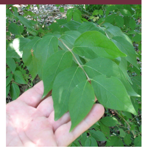
Figure 3. Amur honeysuckle leaves have an opposite leaf arrangement.

Amur honeysuckle [Lonicera maackii (Rupr.) Herder] is a deciduous shrub native to parts of Asia from northeast China to Korea. It was introduced into the U.S. in the mid-1800s but escaped cultivation. It has been used as an ornamental. Amur honeysuckle is not regulated in the Midsouth region. Of the Midsouth states, it is most problematic in Tennessee, but it can also be found in other southern states. Amur honeysuckle is tolerant of a wide range of conditions, and it can completely dominate the understory of deciduous forests.