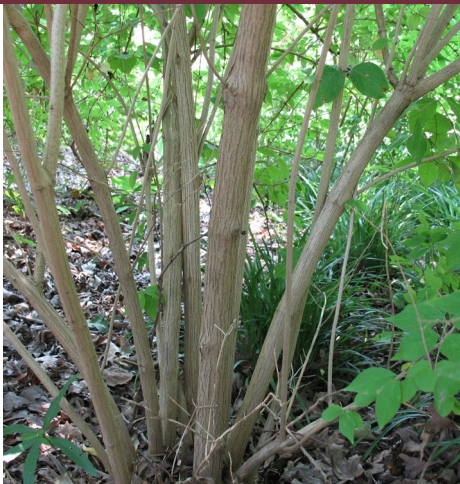
Figure 2. Tan stems.