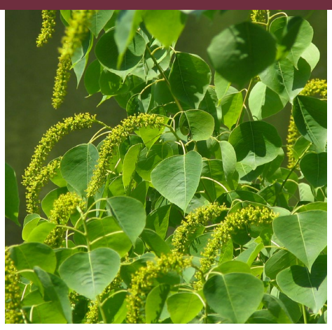
Figure 2. Chinese tallowtree with yellow inflorescences.