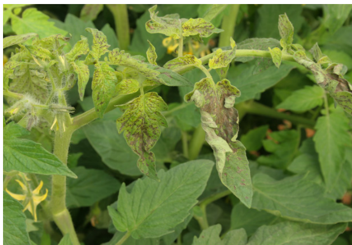
Figure 22. Bronze coloration of leaflets in a tomato plant with tomato spotted wilt.

Tomato spotted wilt (virus: tomato spotted wilt virus , TSWV) can cause significant losses in tomatoes. The virus has a wide host range, including many weed species. Adults of seven species of thrips transmit TSWV. Thrips larvae acquire the virus after a minimum of 30 minutes or fewer of feeding on infected plants. The thrips retain the virus through adulthood. Transmission does not occur until approximately 3 to 7 days after acquisition, after which transmission can occur after feeding on noninfected tissues for 5 minutes or fewer. Adult thrips remain infective their entire lives. Resistant varieties may still develop symptoms.