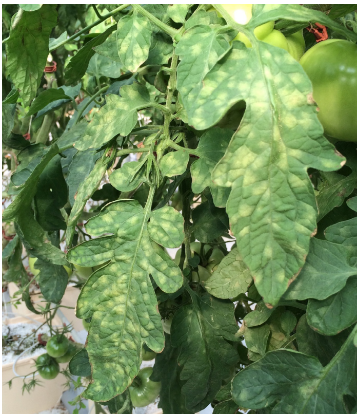
Figure 15. Yellow leaf mold lesions on the upper surface of tomato leaflets.