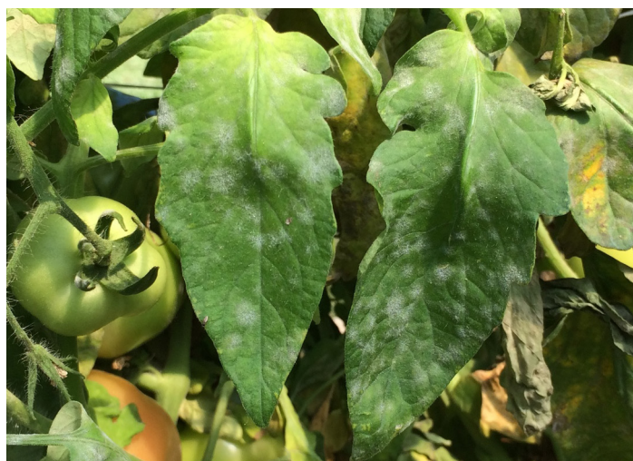
Figure 17. White fungal growth on the upper surface of tomato leaflets with powdery mildew.

Pythium damping-off and stem rot (oomycetes: Pythium spp.) can result in plant loss and poor stand establishment of seedlings in both the field and greenhouse. Damping-off can occur both pre- and post-emergence. Pythium species can survive in the soil for long periods of time in the absence of the host and can persist indefinitely in the soil on organic matter. However, pathogen growth is favored by certain factors, including the presence of moisture.