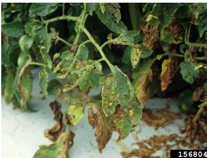
Figure 3. Lesions on tomato leaves with bacterial spot.

Bacterial spot (bacteria: Xanthomonas spp.), like bacterial speck, can be a serious disease of tomatoes and can be difficult to control when disease pressure is high and favorable environmental conditions are present. Abundant precipitation and warm temperatures favor disease development. The pathogen can be spread on seeds, by wind-driven rain, and when handling plants. All aboveground plant parts may be affected. Pathogen resistance to copper has been reported in various locations. In 2017, copper resistance was identified in populations of Xanthomonas perforans in Jasper and Smith Counties