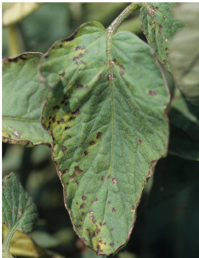
Figure 2. Brown lesions on a tomato leaflet and petiole with bacterial speck.

Management: pathogen-free seed, seed treatment, cultural practices, sanitation, crop rotation, fungicides