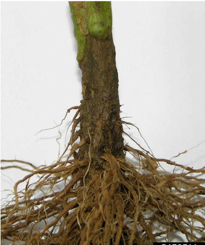
Figure 5. Brown stem lesion on a tomato with bacterial wilt.

be visible on the outside of the stem near the base of the plant ( Figure 5 ). When cut near the base of the stem at the soil/media line, the inside of the stem may be dark and water-soaked ( Figure 6 ). In plants with advanced infections, the stem may be hollow. Cut stems will often exhibit profuse bacterial streaming ( Figure 7 ).