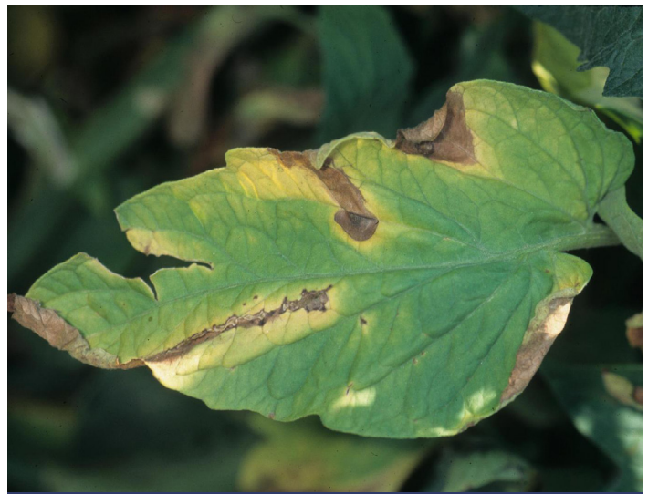
Figure 25. Verticillium wilt lesions on a tomato leaflet.

Management: resistance, vector management, sanitation, cultural practices