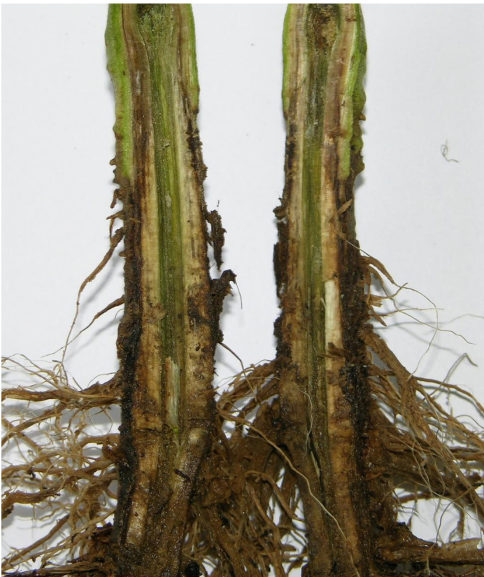
Figure 6. Vascular discoloration in a tomato with bacterial wilt.

Management: clean planting material, resistance (rootstocks), cultural practices, sanitation, crop rotation