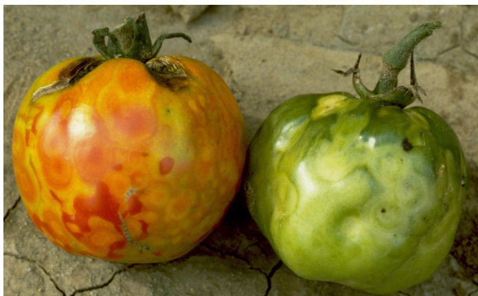
Figure 23. Symptoms of tomato spotted wilt on tomato fruits.

Symptoms: Typically, leaves of plants infected with TSWV develop numerous small, dark spots as well as a bronze coloration ( Figure 22 ). Streaks may develop in stems of infected terminals. Plants may be stunted and leaves may droop to resemble a wilt. Plants that become infected before fruit set may not produce fruit. Plants that become infected after fruit set will have green fruits with slightly raised areas with concentric rings and ripe fruits with chlorotic ringspots with red and white or yellow concentric rings ( Figure 23 ).