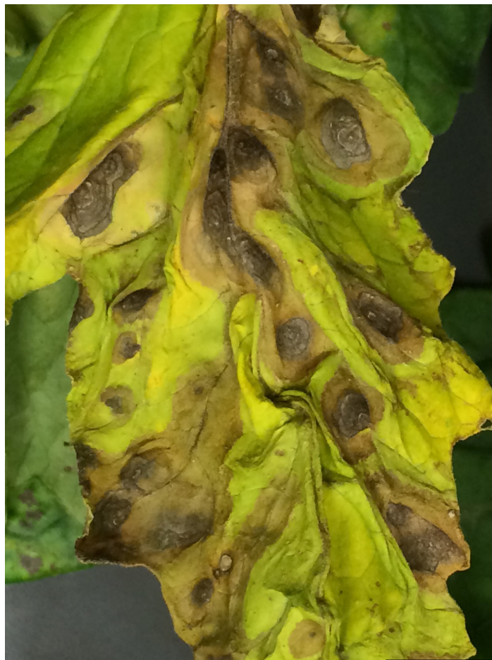
Figure 9. Early blight lesions on a tomato leaflet. Concentric rings are visible in the lesions. The leaf tissue surrounding the lesions on the stem is chlorotic.

Management: crop rotation, sanitation, staking, mulching, fungicides