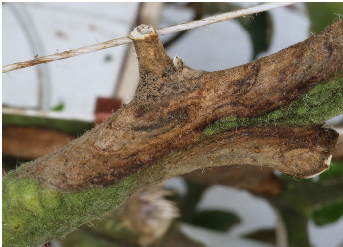
Figure 12. Botrytis lesion on a tomato stem near a pruning wound. Gray fungal growth is present near the center of the stem lesion.

Management: reduce leaf wetness, proper pruning, sanitation, fungicides