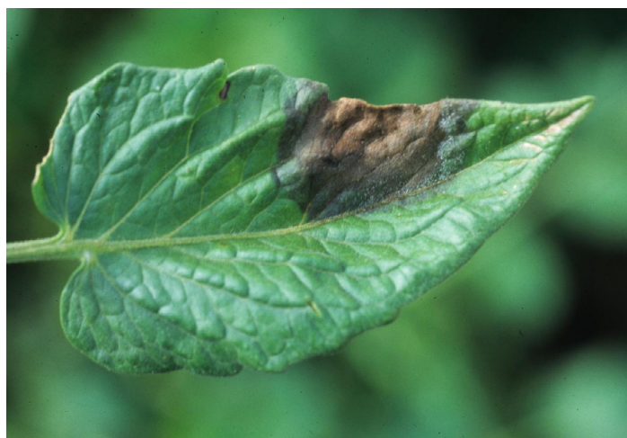
Figure 14. Late blight lesion on a tomato leaflet.

Management: disease-free planting material, sanitation, fungicides