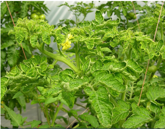
Figure 24. Symptoms of tomato yellow leaf curl in a tomato.

Tomato yellow leaf curl (virus: tomato yellow leaf curl virus , TYLCV) is one of the most devastating virus diseases of tomatoes, and total yield loss has been reported when vector populations were high. TYLCV is transmitted by adult whiteflies. Whiteflies can acquire the virus from feeding on an infected plant in approximately 15 minutes and can transmit the virus after approximately 6 hours. Virus transmission to noninfected plants can occur in approximately 15 minutes of feeding, and whiteflies can retain the virus for several weeks. Tomatoes infected at an early age incur greater yield losses than those infected at an older age. TYLCV is capable of infecting numerous hosts. These hosts can serve as reservoirs of the virus. Resistant varieties of tomatoes can also be infected. These varieties can produce acceptable yields despite infection; however, resistance can be overcome when inoculation pressure is high and infection occurs early.