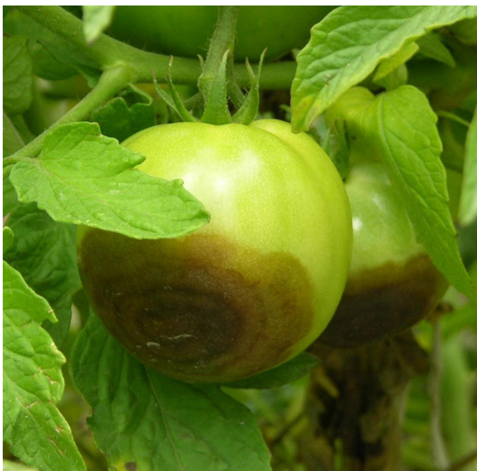
Figure 8. Large, brown, oily-looking lesions on tomato fruits with buckeye rot. Concentric rings are visible in the lesions.

Management: site selection, staking, mulching, cultural practices, crop rotation, fungicides