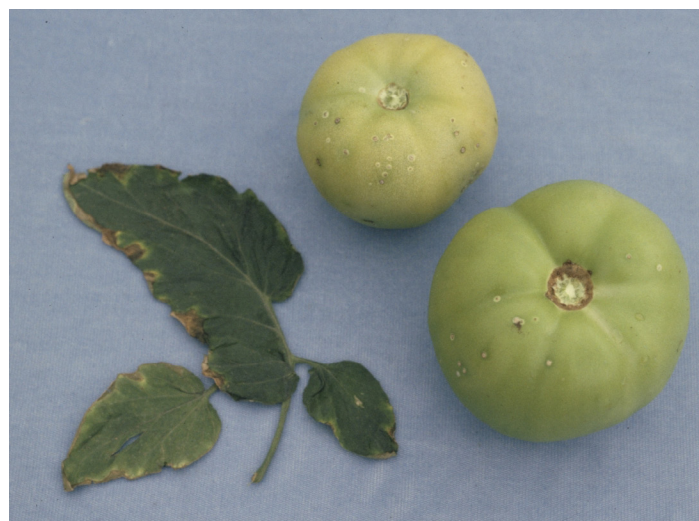
Figure 1. Marginal burning on tomato leaflets and bird's eye spots on tomato fruits with bacterial canker.

Bacterial speck (bacterium: Pseudomonas syringae pv. tomato ) can be a serious disease of tomatoes and can be difficult to control when disease pressure is high and favorable environmental conditions are present.