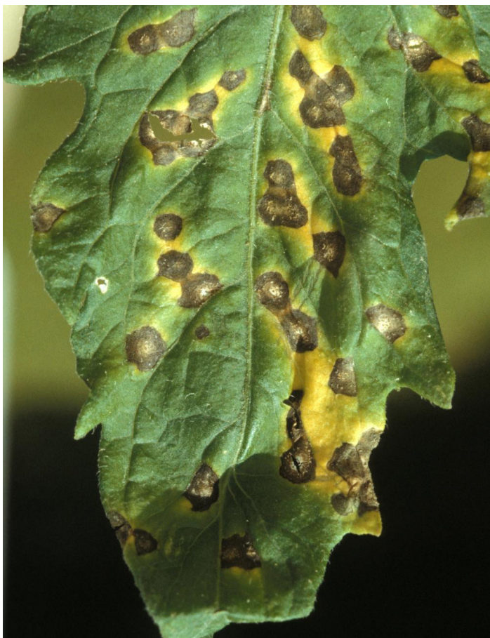
Figure 18. Septoria leaf spot lesions on a tomato leaflet.

Signs/symptoms: The most noticeable symptom of southern blight is a sudden and permanent wilt caused by