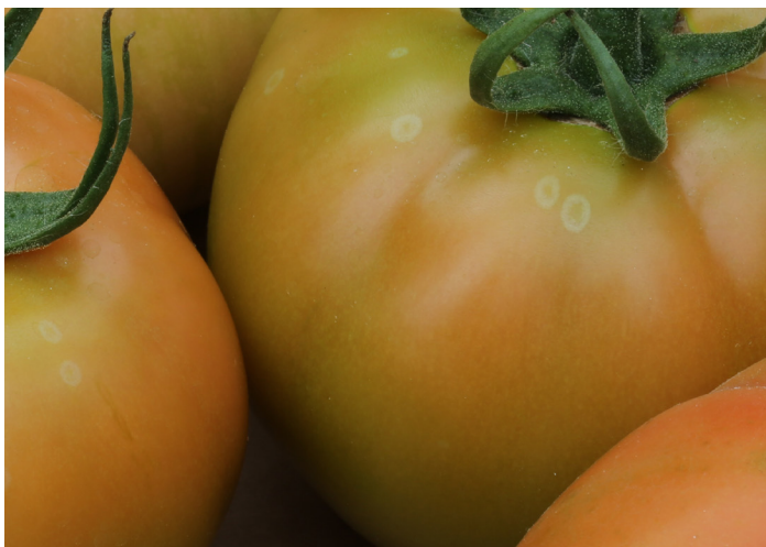
Figure 13. Ghost spots on a ripening tomato fruit.

Late blight (oomycete: Phytophthora infestans ) development is favored by moist weather, cool nighttime temperatures, and warm daytime temperatures. Temperatures greater than 86°F are not favorable for disease development. The pathogen is seedborne and can survive on susceptible hosts and weeds. P. infestans also infects and causes late blight in potatoes.