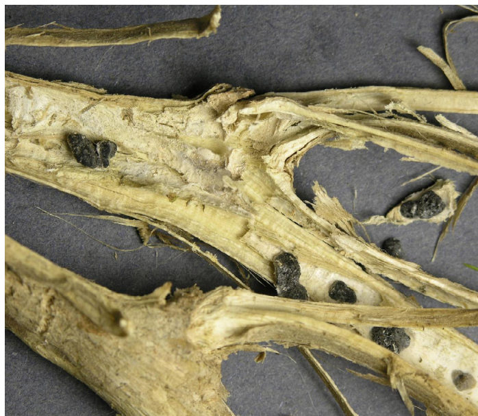
Figure 21. White mycelial growth and black sclerotia present inside a timber rot stem lesion on a tomato plant.

Signs/symptoms: Disease typically begins as water-soaked areas near leaf axils or in stem joints. Stems become soft once infected and eventually become light gray or tan and have a bleached appearance ( Figure 21 ). When environmental conditions are favorable, white mycelium often develops on or in infected stems. Black sclerotia that look like rat droppings are often present on the fungal mycelium or inside infected stems ( Figure 21 ). These sclerotia are typically black on the outside and