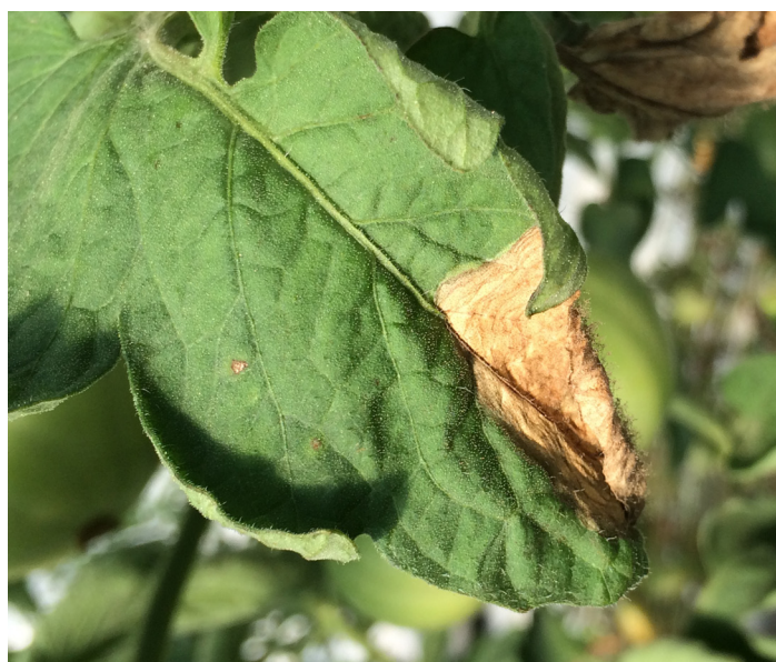
Figure 11. Botrytis lesion on a tomato leaflet. Gray fungal growth is visible in the area of the lesion on the edge of the leaflet.

Signs/symptoms: Tan or gray lesions typically form at the tips of leaflets and become covered with brown or gray fungal growth ( Figure 11 ). Dead flowers and dying calyx tissue may also become infected. Stem cankers may also develop, often as a result of pathogen invasion at a pruning wound ( Figure 12 ). These typically large, brown cankers may girdle the stem, causing wilting and plant death above the canker. Another symptom associated with gray mold is the production of “ghost spots,” small,