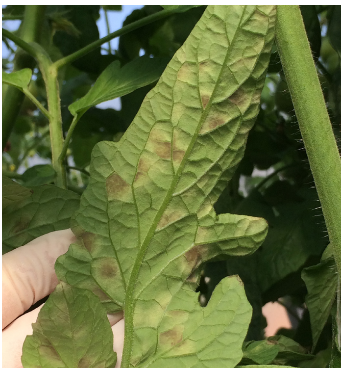
Figure 16. Olive-green fungal growth on the lower surface of a tomato leaflet with leaf mold.

beneath yellow lesions ( Figure 16 ). Infected leaves typically collapse and wither. Leaf mold is a foliar disease; symptoms are only expressed on leaflets.