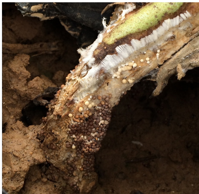
Figure 19. White fungal growth and round, tan and brown sclerotia of the southern blight pathogen.