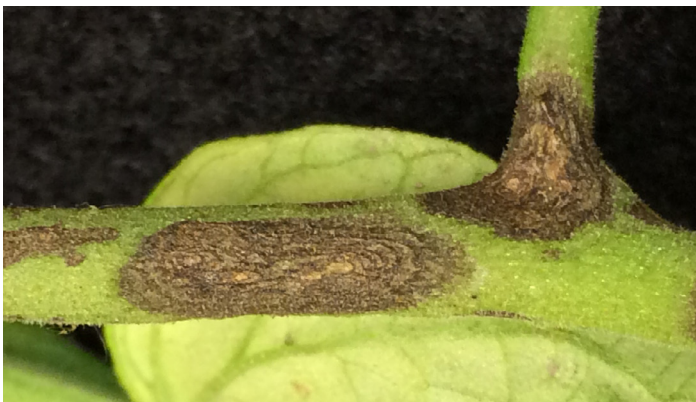
Figure 10. Early blight lesions on a tomato stem. Concentric rings are visible in the lesions.

Fusarium wilt (fungus: Fusarium oxysporum f. sp. lycopersici ) is considered to be a warm-weather disease. The pathogen, which is divided into three rac es—all capable of causing disease, is soilborne and can survive in the soil for many years. It is commonly transmitted on infected transplants and through contaminated soil or equipment. Infection is favored by root wounds, which may be caused by root-knot nematodes . Cultivars resistant to one or more races of the fungus are commonly used to manage disease. Note: Other species of Fusarium also infect and cause diseases, such as Fusarium crown and root rot, in tomatoes.