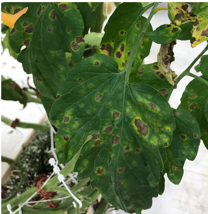
Figure 20. Target spot lesions on tomato leaflets. Leaflet lesions have a target-like appearance and are typically surrounded by chlorotic tissue.

Signs/symptoms: Symptoms may develop on leaves, petioles, stems, and fruit. Symptoms on leaflets begin as small, water-soaked lesions that expand and become light brown and circular ( Figure 20 ). These lesions often develop a target-like appearance. Yellow halos develop around individual lesions ( Figure 20 ). Lesions may coalesce and result in the collapse of leaflet tissue. Similar