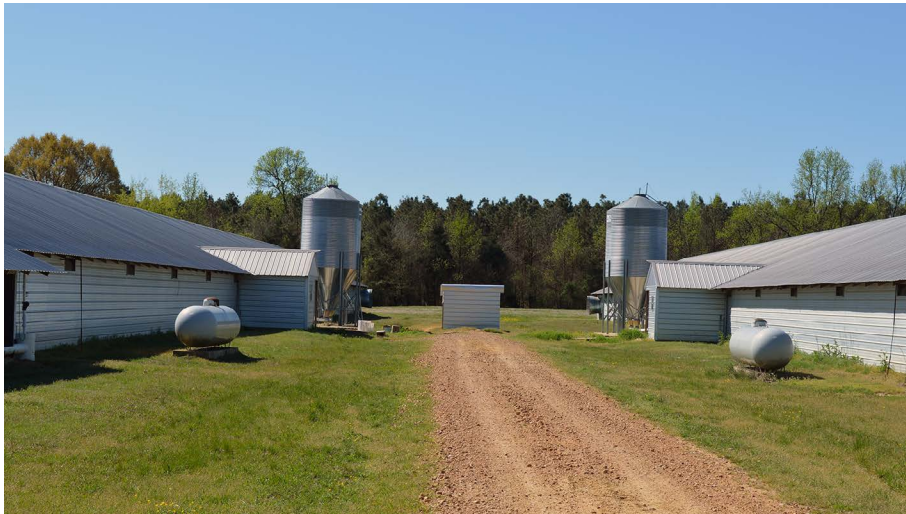
Figure 2. Many producers choose to drill wells between poultry houses.

Producers often disagree with the well driller on exactly where the well should be located. However, in most cases, the well driller is right. Well drillers understand what works best when it comes to a location site and drilling a well. They understand the local area—both the aboveground topography and the aquifers that lie beneath. They have drilled wells for poultry farms before. In most cases, they will know how deep the well will need to be to find an adequate water supply and what kind of volume can be expected from a particular aquifer. If you and the driller disagree on a site for the well, listen to the reasons why the driller thinks a different site is better. Drillers are paid to drill wells, and, most likely, they will drill where you tell them. But keep in mind, they drill wells every day and have likely picked up a thing or two along the way about what works and doesn't work and why.