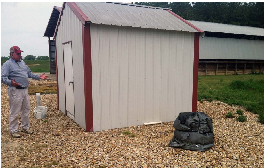
Figure 1. Many producers build some form of house over the well casing to protect it from the environment and other dangers.

Contamination by surface water may occur if the top of the well casing is compromised and/or open. The top of the well casing should be at least 1 foot above the ground. The ground around the well casing should slope down and away to ensure proper drainage. Always keep hazardous chemicals, such as paint, fertilizer, pesticides, and petroleum products, away from the well. Build the generator shed and diesel storage tank away from the well site to prevent the risk of a fuel spill from reaching the well shaft and contaminating the aquifer. Many producers build some form of house over the well casing to protect the casing and shaft from the environment and other dangers (such as cattle or other livestock) ( Figure 1 ). Some producers pour a concrete slab around the well casing and build the house on the slab, while others simply build the house over the well without a slab. Some wells have no cover at all, and these, depending on where they are located, are most at risk of being compromised or contaminated.