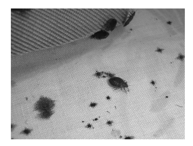
Figure 3. Bed bugs and fecal spots on a mattress.

Simple precautions may help protect you and your belongings from bed bug infestation. Leave all unnecessary items in your vehicle, such as extra clothing, gear, and equipment. When first entering your hotel room, place luggage on the bathroom vanity until you have had a chance to inspect the premises (do not place luggage on the bed, floor, chair, sofa, or luggage rack). Pull back the sheets and check the mattress and box springs for live bed bugs or black fecal spots ( Figure 3 ).