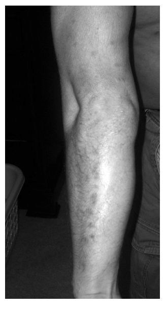
Figure 2. Bed bug bites on arm 5 days post-bite.