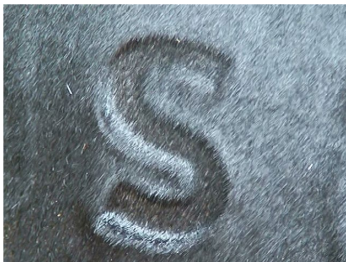
Outline left by freeze branding.

Keep up with the amount of time the iron contacts the hide to get the full 45- to 60-second application. A watch or timer displaying seconds is an important piece of equipment to have on site when freeze branding.