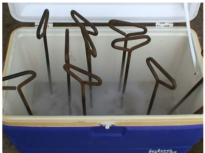
Irons in dry ice and alcohol.