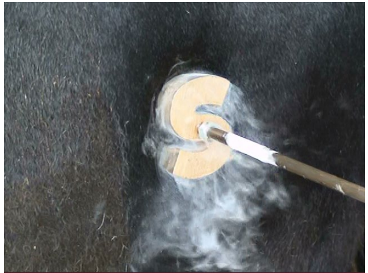
Copper alloy freeze branding iron.

Place irons in an ice chest with enough dry ice and alcohol to submerge the branding surface completely, at least 2 inches up the handle. About 2 inches of crushed dry ice covering the bottom of the cooler will be needed. The alcohol/dry ice mixture will slowly evaporate, so add alcohol and dry ice throughout the working session to keep the iron surfaces submerged. Irons are ready to use when the refrigerant mixture stops boiling and frost builds up around the base of the irons. Waiting 15 to 20 minutes from the time the irons are placed in the cooler until first use is a good rule of thumb. Usually, the more irons cooled at once, the longer it takes to cool them. When irons are reused, cool them at least 1 to 2 minutes between applications.