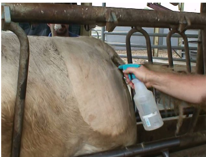
Spraying denatured alcohol on the branding area.

Before applying branding irons to the hide surface, make sure that the animal is properly restrained (preferably in a squeeze chute). Clip, clean, and spray the branding area with a layer of denatured alcohol.