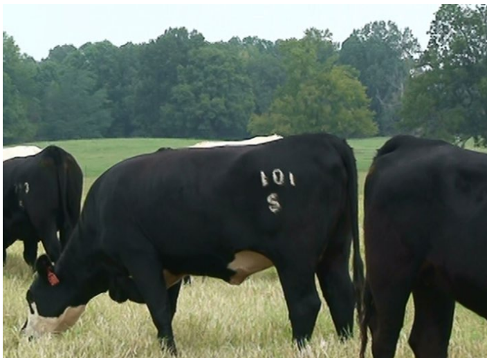
Unique animal identification brand.

One of the oldest forms of individual animal identification is branding. Branding is a form of permanent identification that also helps protect against livestock theft. Brands can identify herds, where each animal has the same herd identifier. They can also identify individual animals, where each animal has a unique identifier.