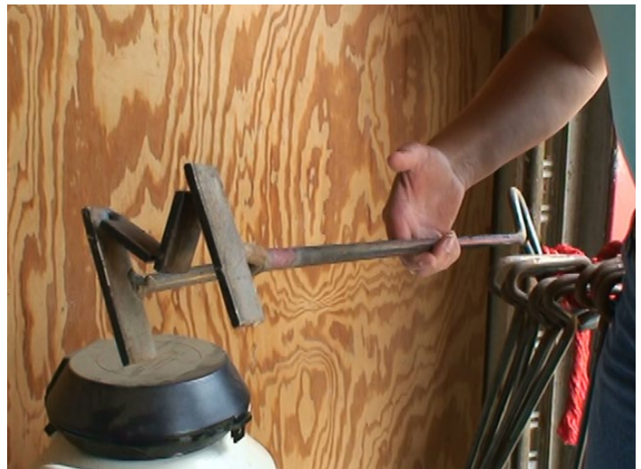
Hot branding iron.