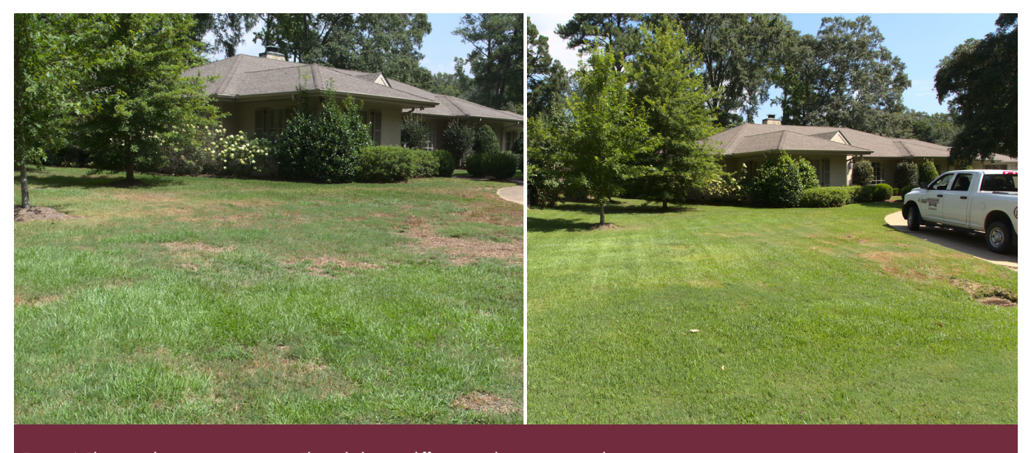
Figure 4. The same lawn one year apart. The only known difference is better water and mowing practices.

turf. It occurs when the turf decays slowly before dying. A thatch layer deeper than about three-fourths of an inch tends to raise the turf crowns and roots out of the soil, exposing them to high and low temperatures and drought. Many harmful fungi also survive in the thatch layer. You should work to lessen thatch. Thatch is most common in zoysiagrass.