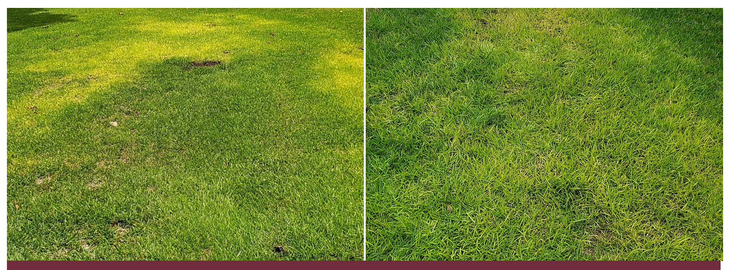
Figure 2. Yellow patches in St. Augustinegrass resulting from excessive rain which kept the soil near field capacity for protracted periods. ERI seem to grow quickly in these conditions. Examining the roots under the yellow patches will show they are beginning to decay (see Figure 3). The bright yellow color seen here occurs infrequently, typically it is a duller yellow.