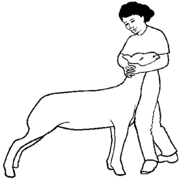
Figure 1. Drive your lamb by pushing back on its shoulder area with your knee or leg.

Always be ready for the judge to handle the lamb. Train the lamb to brace or push against your leg; this is known as "driving" the lamb. By driving into your leg, the lamb's muscles tighten up, feel firmer, and appear large and pronounced. Train the lamb to respond to pressure when asked to drive as opposed to standing squarely in line. When driving the lamb, stand in front and hold its head securely with the lamb's nose tilted upward (Figure 1). Gently push back on the lamb with the inside of your leg placed on the lamb's breast and shoulder area.