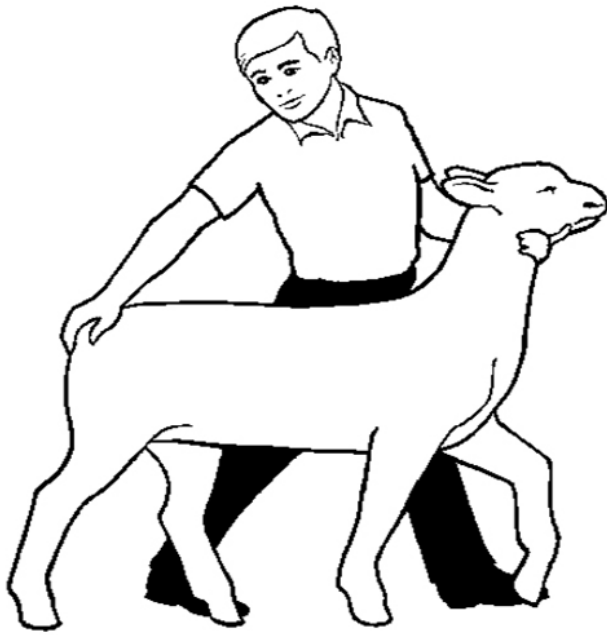
Figure 2. Lift the lamb's dock to encourage your lamb to walk.

pulled from the profile line, move forward to fill any resulting space. Reset your lamb, and watch the judge with each move forward. Once you are pulled to the placing line, remember the class is not over. Be sure to keep the lamb set up and looking its best.