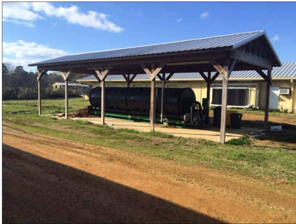
Figure 5. In-vessel or rotary drum composter.

Static bin composters with both primary and secondary bins are more labor-intensive because, once a smaller primary bin is full, it needs to sit for roughly 2 weeks. During this time, microbes break down roughly half the carcass material. However, they eventually run short of oxygen and the material has to be turned into the secondary bin for the process to be completed. After