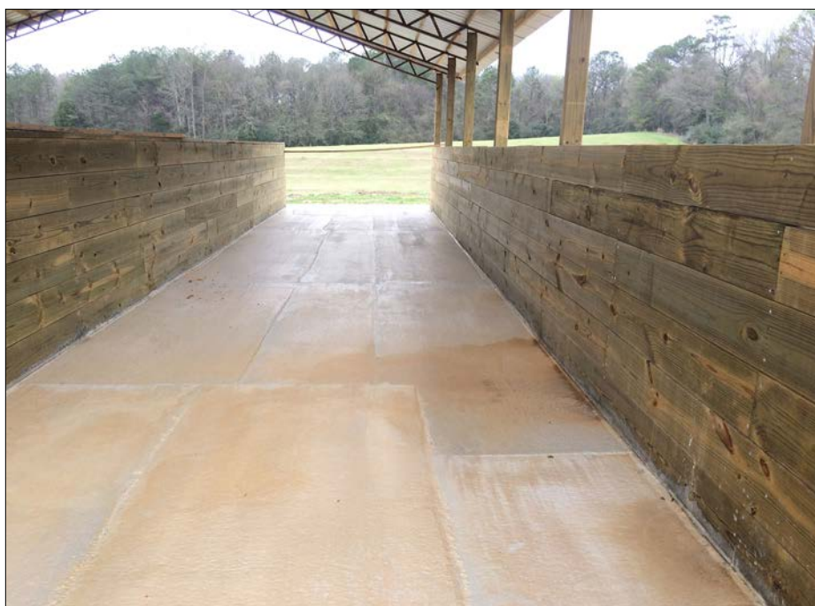
Figure 2. Alleyway composter.

Composting is the most widespread method for proper and complete decomposition of poultry carcasses. The materials needed (poultry carcasses, litter or alternative carbon sources, and perhaps water) are readily available on every commercial poultry farm. Availability of cost-share funds to offset composter facility construction costs has contributed to an increase in the use of composting. However, attention to management is essential for success . Failure to properly manage the system will create odors and flies and attract unwanted scavengers and other vermin to the site. Proper management is vital to avoid nuisance complaints. Orderly loading of ingredients is critical for efficient compost activity.