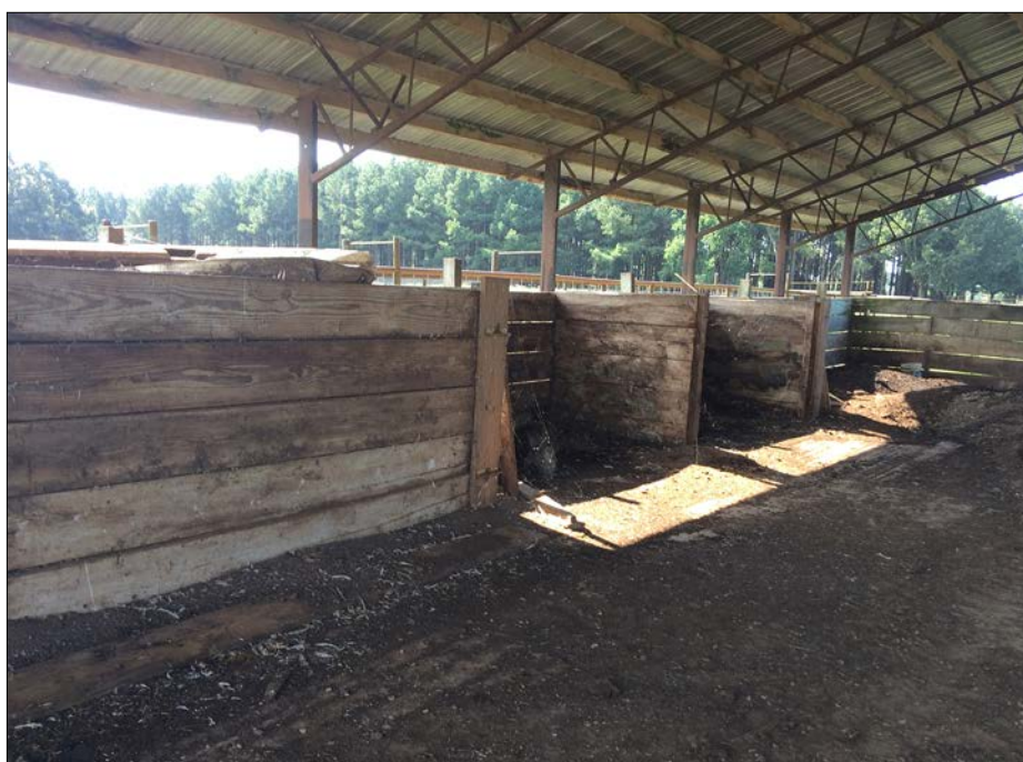
Figure 1. Static bin composter.