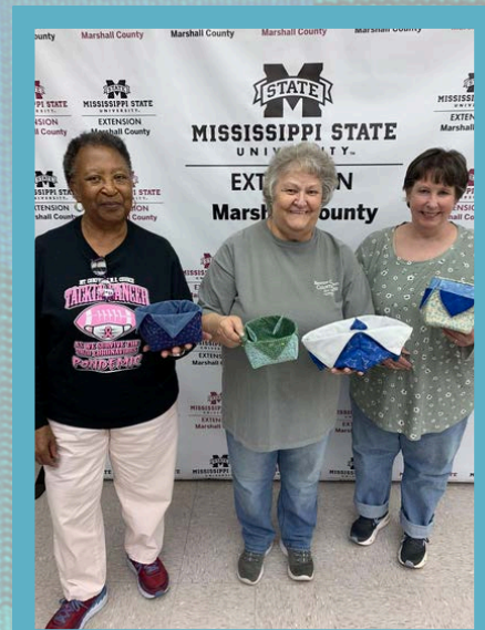
Pictured above are Marshall County Happy Quilters with their material boxes that they made at their March meeting.

Marshall County Happy Quilters groups presented a “Quilting Demonstration” in Benton County! They showed how to measure, cut & sew blocks to make quilts. They showed off the quilts they’ve been working on and gave insight on how get started sewing/quilting!