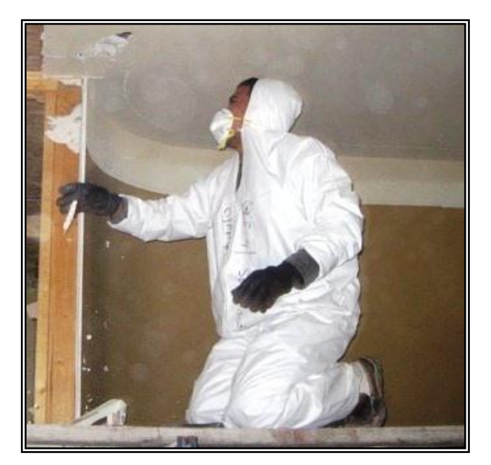
Photo 5: During demolition, workers should wear a minimum of goggles, gloves, and an N-95 respirator for protective gear. The worker above lacks eye protection and is improperly wearing his respirator straps.

The contractor is responsible for the protection of workers at the job site. Basic protection during demolition work includes an N-95 respirator (a high quality dust mask), goggles, and work gloves. If workers are required to wear a respirator, then the contractor must have a respiratory protection Specific worker sensitivities should also program. be considered. During removal of CDW, workers are also exposed to nuisance sulfide odors and potentially irritating particles. These exposures have not been measured and additional protective measures are not required at this time; however, they may be incorporated as an additional margin of safety for workers. Care should be taken to not track CDW dust or wear contaminated clothing out of the work area.