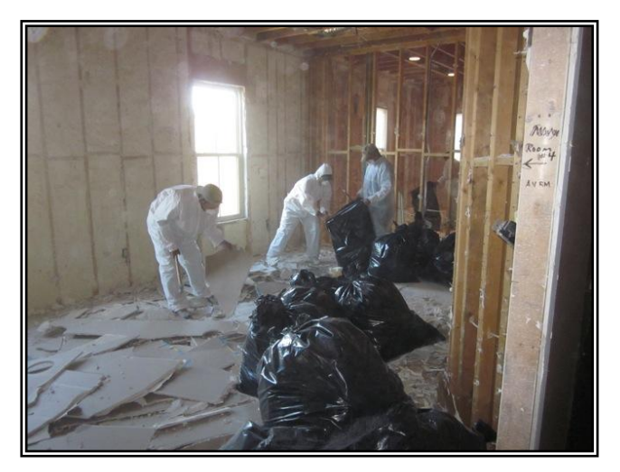
Photo 6: CDW can be disposed of as general demolition waste, but must never be recycled.

CDW debris can be disposed of as general construction waste (local requirements may vary) but should never be recycled.