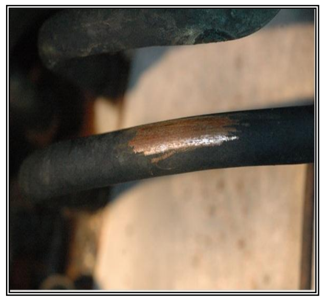
Photo 2: Blackening of copper surfaces indicates sulfur corrosion.

Sulfide gases produced by CDW react with metal surfaces to form black corrosion (i.e., copper sulfide, silver sulfide). This corrosion has been associated with the failure of air-conditioning coils as well as damage to electrical and mechanical systems and contents of the building belonging to the occupant.