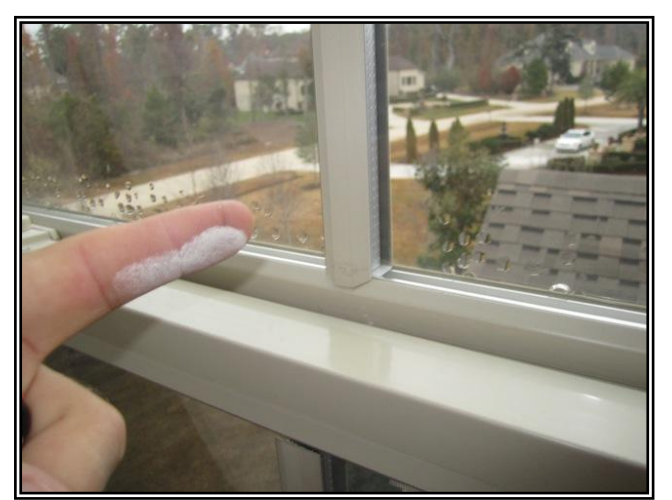
Photo 7: Inspector identifies visible dust after attempted cleanup. The presence of dust indicates that additional work is required.

Elimination of demolition dust requires a systematic cleaning pattern and attention to detail. After removal of debris and larger particles, all surfaces should be cleaned until no demolition dust is Frequently, this is done by HEPA present. vacuuming followed by damp wiping. When site personnel believe that cleanup is complete, the project manager or third-party consultant should verify the cleanup results. First, the inspector should determine whether all remnants associated with drywall specified for removal have been eliminated. Air-moving devices in use should be shut off prior to the inspection to allow for suspended dust to settle. Dust inspection should be performed with a bright flashlight and is facilitated by wiping surfaces with a dark cloth. To the extent feasible, the inspector should access hidden surfaces for inspection. Further guidance on conducting dust inspections can be found in ASTM E1368-05, Standard Practice for Visual Inspection of Asbestos Abatement Projects. The contractor should be encouraged to perform additional spot cleaning during the inspection, but should not be permitted to continue with other work until all surfaces in the work area are considered dust-free.