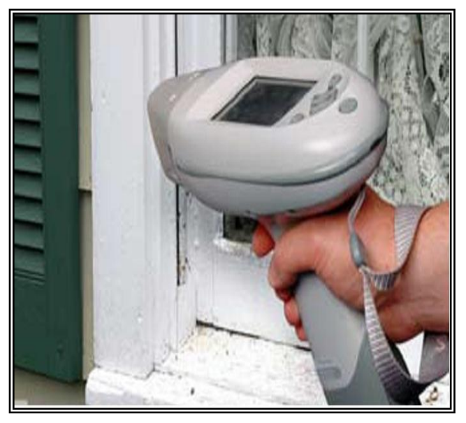
Photo 3: On-site XRF analysis can be helpful for locating corrosive drywall panels, but several factors must be considered in data interpretation.

Appendix A includes an example of a detailed CDW investigation.