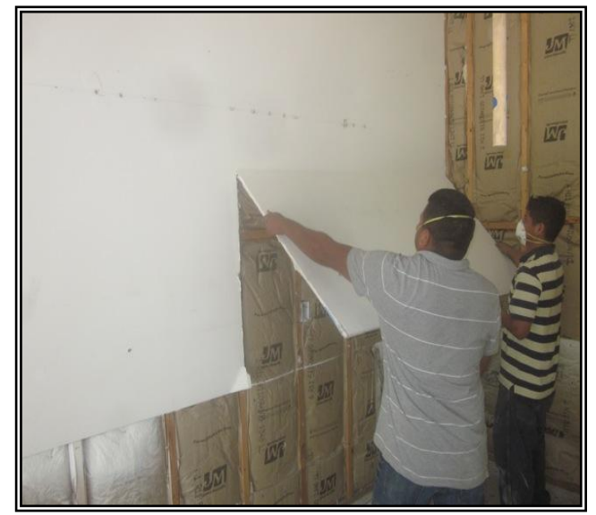
Photo 4: Most CDW remediation projects replace all drywall, but selective removal can be considered in some cases. Note that the workers are improperly wearing their respirator straps and the workers' street clothes are exposed to contaminated dust. This can be avoided by properly wearing a respirator mask and protective coveralls.