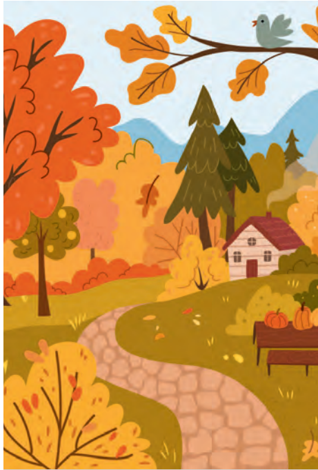
EXHIBIT DAYS AHEAD!

Our 2024 Exhibit Days are just around the corner. This year it will be held at the Springhill District Building, 2556 Clayton Road, on Monday, September 16th, through Wednesday, September 18th. This is an annual competition open to Lee County residents dating back to fair days downtown. We offer many ways for local residents, ages five and up, to show off their skills and abilities by offering many exhibit categories based on age. Several exhibition divisions are available for entry based on age and include Expressive Arts, Photography, Creative Sewing, Hobby Skills & Crafts, Canned & Dried Foods, and more!