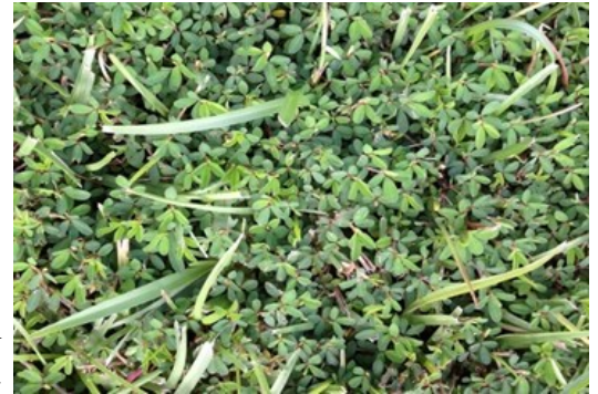
Lespedeza taking over an unhealthy centipede lawn

Lawns thin out for several other reasons. Drought stress thins out the desirable species, and disease pressure causes the lawn to thin. Insects will kill the turf. After the turfgrass is gone, weeds move in. The presence of a great number of weeds is a sign the turfgrass is not thriving. Your local Extension office can help; but, before you can make the lawn succeed, you need to find the cause.