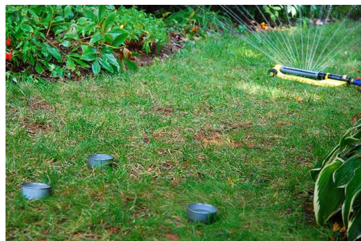
Tuna cans used to measure sprinkler water output

A way to tell how much your sprinklers are putting out is to use the tuna can technique. A tuna can is typically one inch deep and is an accurate and reliable way to measure the amount of water put out by your automatic in-ground irrigation system or your sprinkler attached to a hose that you move around yourself. You will want to place empty tuna cans at various spots around your yard within the range of your sprinkler(s). Turn on the sprinkler system and allow it to run for roughly 30 minutes. After 30 minutes, measure the amount of water collected in each can. If the cans collected an inch of water, then you know you need to water for 30 minutes. If the cans collected more or less than this amount, then calculate approximately how long you need to adjust the time up or down to apply the correct amount of water to your landscape so that it receives the recommended one inch of water in each watering session. If there is run-off before water application amount reaches the one inch mark, more waterings per week may be needed. This is especially true on clay soils or sloped terrain. Sandy soils may require more frequent and heavier amounts but let the turf tell you when its time to water. Don't always rely on the automatic sprinkler system you see running even during a rain event.