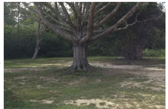
Lawn thinning out by shade created from this mature Sawtooth oak