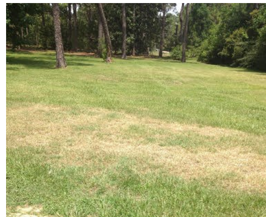
Drought stressed grass

As we move into the heat of the summer, we start to notice the effects of moisture stress more readily and frequently between rain events. One question I receive from homeowners typically is they want to know how much and how long to leave the sprinklers on. Honestly there are too many variables to give one cookie-cutter answer to this question. You will need to do some experimenting to determine what is needed for your lawn. It is recommended that your lawn gets one inch of water per week through irrigation or natural rainfall.