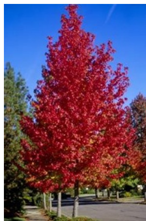
Fall color of Sweetgum