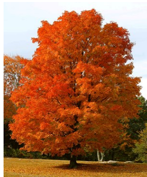
The brilliant orange fall color of Sugar Maple

Temperature, light, and water supply have an influence on the degree and the duration of fall color. Low temperatures above freezing will favor the bright reds in maples. However, early frost will weaken the brilliant red color. Rainy and/or overcast days tend to increase the intensity of fall colors. The best time to enjoy fall color would be on a clear, dry, and cool day. So, enjoy it while it lasts, even for such a short time.