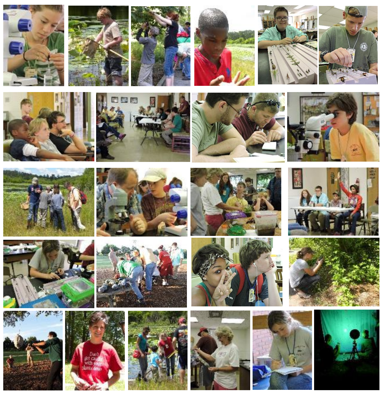
For those who receive a hard copy of The Gloworm , the photos in the archives are in color.

Visit The Gloworm archives at http://msucares.com/newsletters/pests/gloworm/index.html.