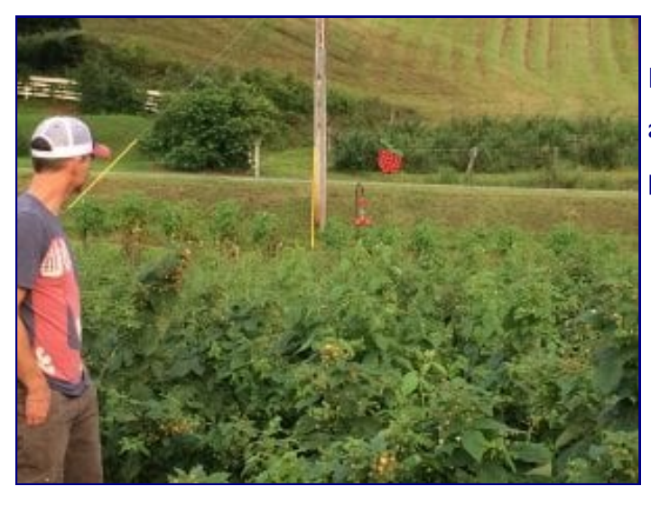
Fig. 2. A grower at the SWD workshop watches as a hummingbird visits a feeder in the raspberry planting.

Two grower demonstrations were undertaken this year, as well. One in blueberry and one in raspberry. Both growers undertook cleaning the feeders and changing the sugar solution twice per week to keep the hummingbirds well fed and active within their plantings. At the workshop held in Salem, NY last month, several of the tiny birds were seen dashing about.