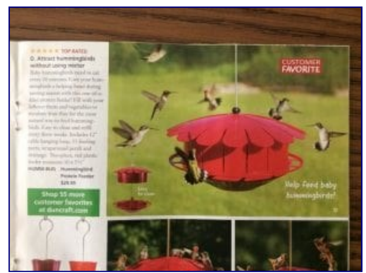
Fig. 4. A humming"baby" feeder?

If you think hummingbirds don't eat small insects, then guess again! I've seen these contraptions showing up in stores this year — to feed hummingbirds. They are rearing capsules for fruit flies (vinegar flies, as entomologists call them). Perhaps someone should tell them we don't need more SWD? ...just more hummingbirds!