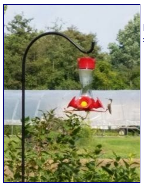
Fig. 3. Female or young ruby-throated hummingbird on a feeder set above a blueberry planting.

If you think hummingbirds don't eat small insects, then guess again! I've seen these contraptions showing up in stores this year — to feed hummingbirds. They are rearing capsules for fruit flies (vinegar flies, as entomologists call them). Perhaps someone should tell them we don't need more SWD? ...just more hummingbirds!