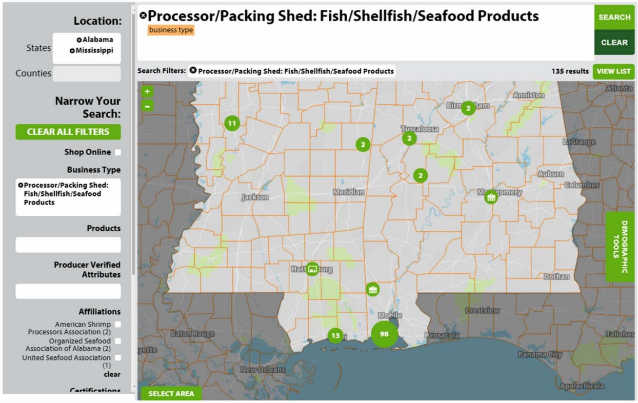
Figure 6. Map of the locations of fish and seafood processors in Mississippi and Alabama (Mississippi MarketMaker, 2020).