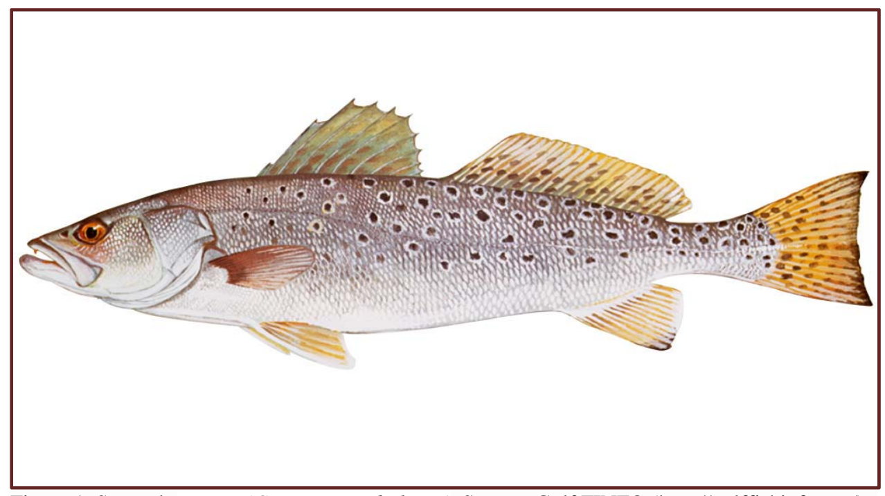
Figure 1. Spotted seatrout ( Cynoscion Nebulosus ). Source: Gulf FINFO (<a href="http://gulffishinfo.org/">http://gulffishinfo.org/</a>).

According to Gulf FINFO (<a href="http://gulffishinfo.org/">http://gulffishinfo.org/</a>), "spotted seatrout (Fig. 1) which are also known as speckled trout, are found in coastal waters of the western Atlantic Ocean from Massachusetts to Florida and throughout the entire Gulf of Mexico. They are most common along the northern Gulf and Florida Gulf Coast."