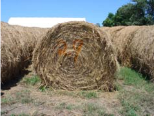
The Mississippi Hay Directory is now available to assist producers