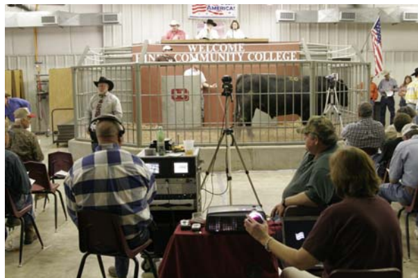
Distance bidding sites in North MS were new for the 2006 sale

Simmental—1 bull Gross receipts—$2,200 Average price—$2,200 High-selling lot—$2,200